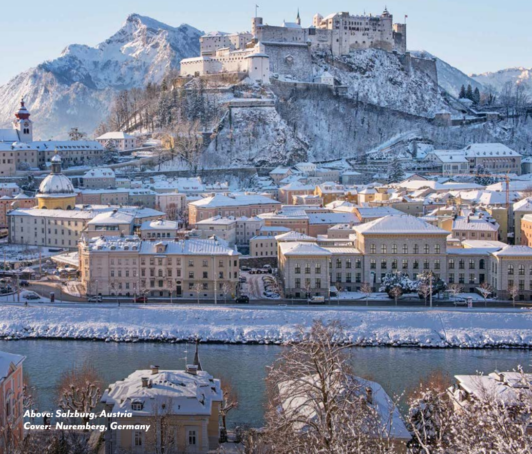
Above: Salzburg, Austria Cover: Nuremberg, Germany