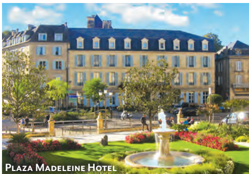
PLAZA MADELEINE HOTEL