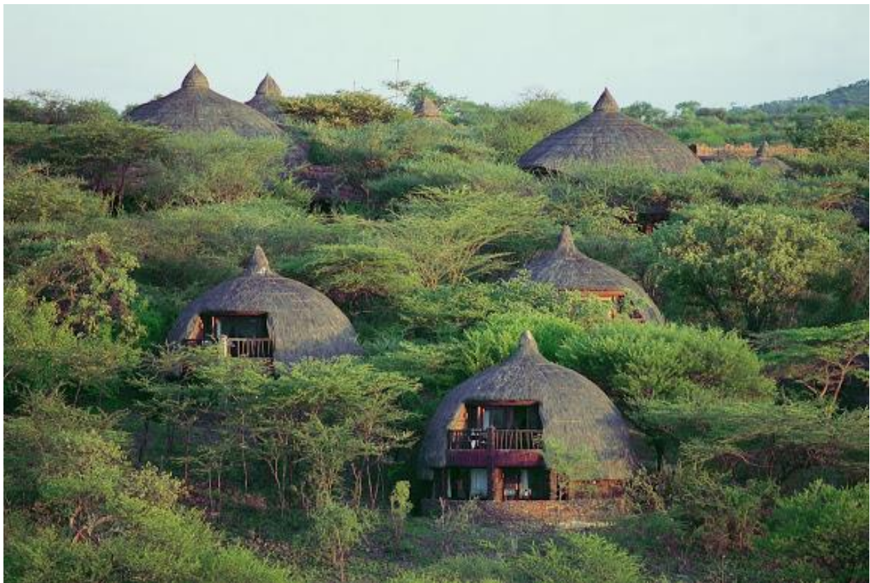
Serengeti Serena Safari Lodge