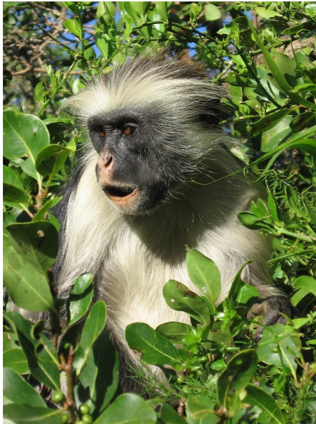
Red Colobus Monkey / Safari Legacy - jkunath