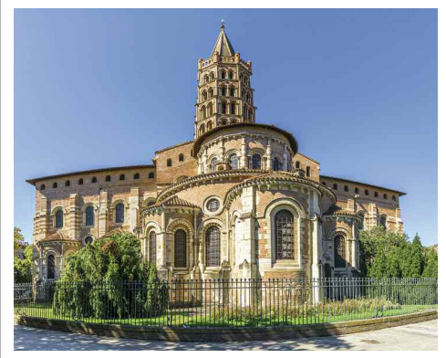
Saint Semin Basilica