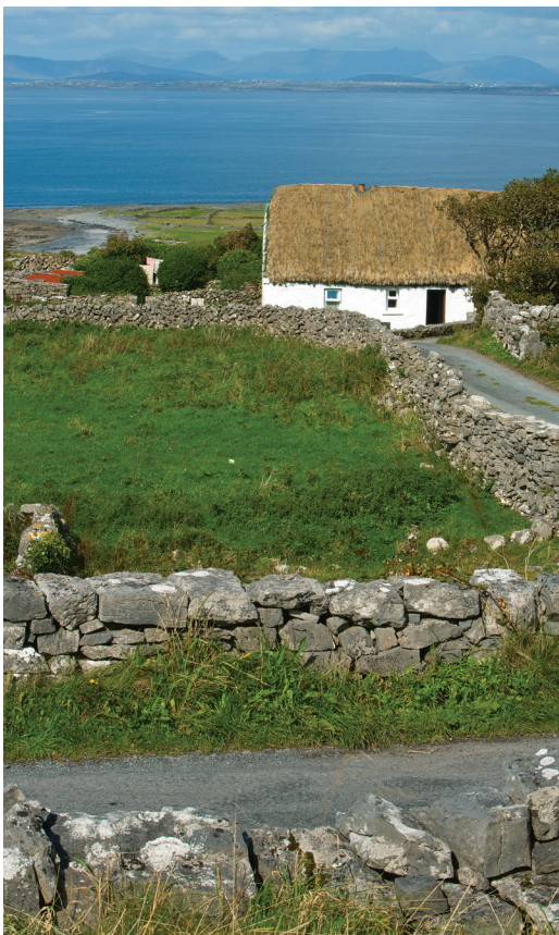
We spend Day 6 on the Aran Islands’ Inishmore.