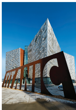
Titanic Museum, optional extension

Day 11: Kilkenny Today is devoted to Kilkenny, a well-preserved medieval city known as Ireland’s cultural capital – and the country’s smallest city. We tour 12 th -century Kilkenny Castle, considered one of the country’s most beautiful, then embark on an informal walking tour