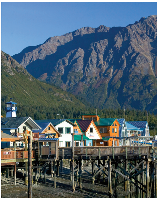
Colorful buildings overlook Seward's harbor.

safe environment. Tonight, we celebrate our journey through Alaska at a farewell dinner. B,D