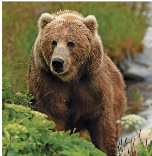
We may see bears in Alaska.

Day 10: Seward/Anchorage Today we return to Anchorage, stopping for lunch on our own on the way. Upon arrival in Anchorage, we visit the Alaska Wildlife Conservation Center, a non-profit organization dedicated to providing quality animal care and preserving Alaska's wildlife. With 200 acres of spacious enclosures, the center offers an opportunity to see injured or orphaned bears, moose, elk, wolves, caribou, and more display their natural behavior in a