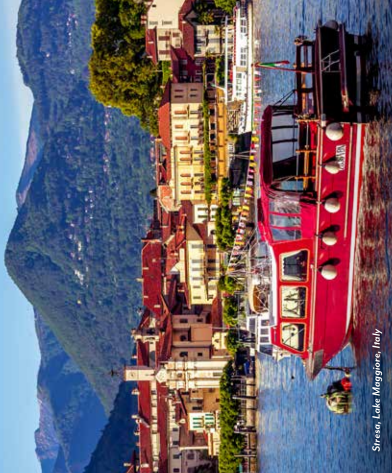
Siresa, Lake Maggiore, Italy