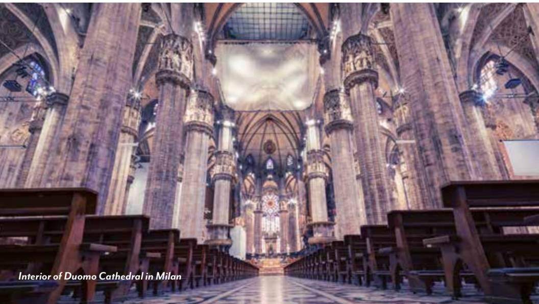
Interior of Duomo Cathedral in Milan