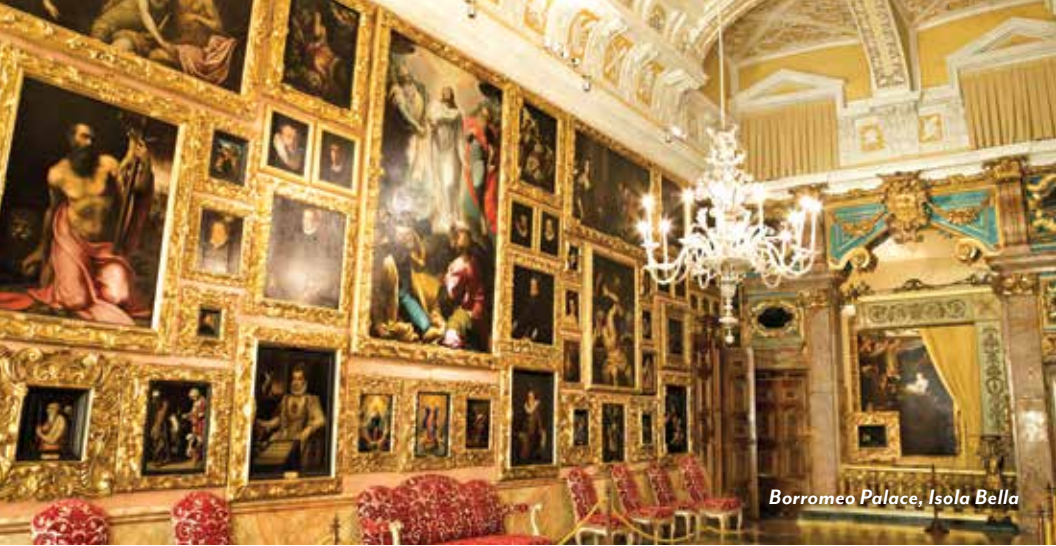
Borromeo Palace, Isola Bella