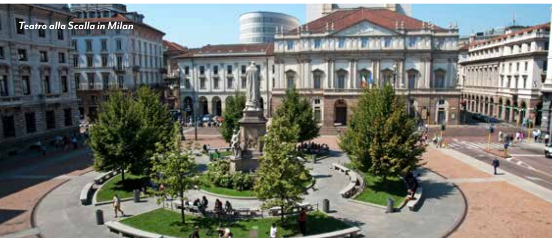
Teatro alla Scala in Milan

Visit Milan’s world-famous Teatro alla Scala opera house, a neoclassical jewel of gilt boxes and glittering chandeliers. Continue to the city’s