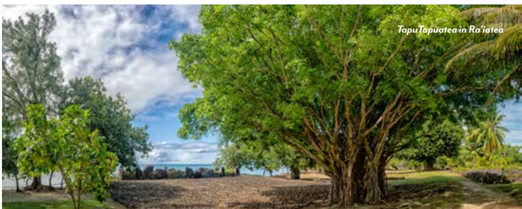
Tapu Tapuatea in Ra'iatea