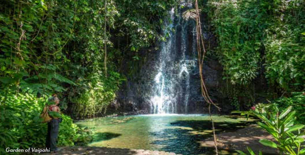
Garden of Vaipahi

and trees. You can also opt to tour the grounds of a vanilla plantation, which includes time to snorkel and potentially encounter stingrays. Next, dig your bare feet in the sand and savor an included beach barbecue lunch on a private motu, where you can also swim, snorkel or kayak. (B,L,D)