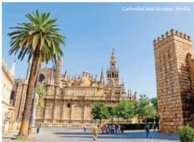
Cathedral and Alcázar, Sevilla