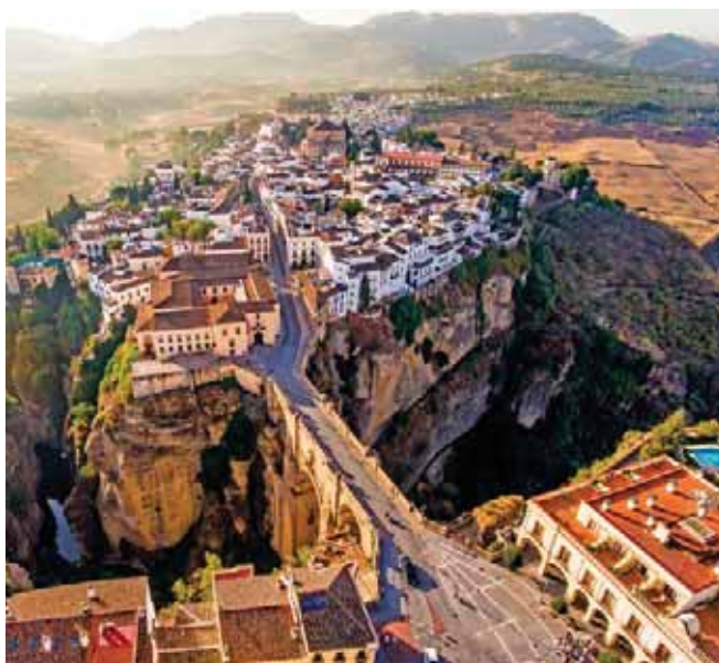
El Tajo Gorge, Ronda