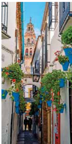
Jewish Quarter, Córdoba