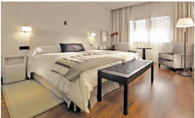
Real Alcázar, Sevilla