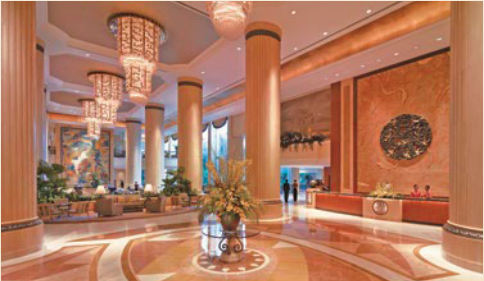
Shangri-La Singapore | Singapore