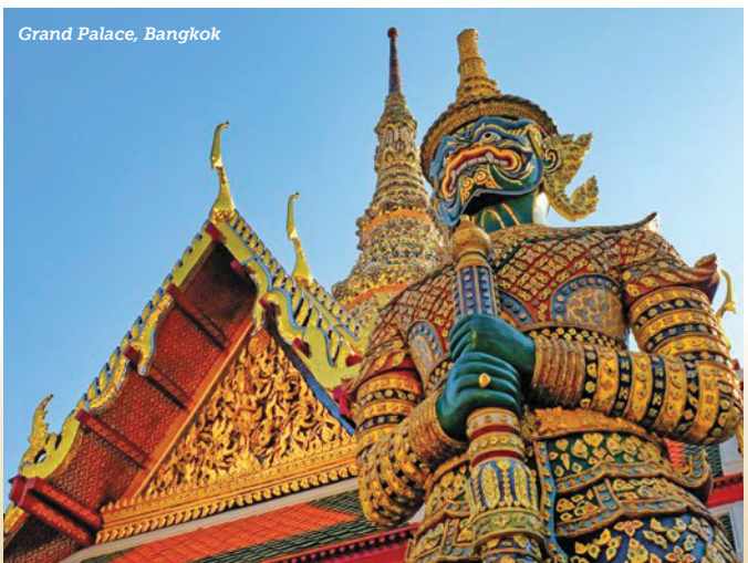
Grand Palace, Bangkok