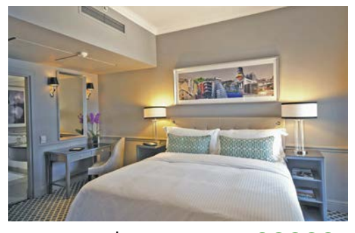
54 on Bath | Johannesburg