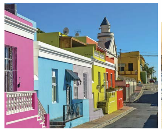
Colorful Bo-Kaap, Cape Town

In 1580, English navigator Sir Frances Drake described the Cape of Good Hope as the "fairest cape ... in the whole circumference of the earth." The peninsula is a part of the Cape Floral Region, considered to have the most diverse range of plant life in the world. At Cape Point, ascend the high sea cliffs by funicular to admire dramatic coastal views.