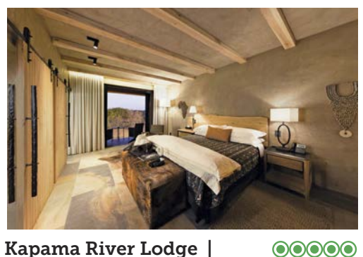
Kapama River Lodge | Kapama Private Game Reserve

Our travel experts have selected these luxury properties for your comfort. The hotels' prime locations put the cities at your doorstep, and the game lodges sit in the heart of game-rich parks, allowing you to immerse yourself fully in the safari experience. Details in the design and décor celebrate the local culture and enhance the ambience of each hotel and lodge. Their restaurants feature menus of elegantly prepared local and international cuisine. Of utmost importance is the superior quality of the services, amenities and accommodations, allowing you to maximize the enjoyment of your stay.