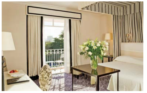
Belmond Mount Nelson Hotel | Cape Town