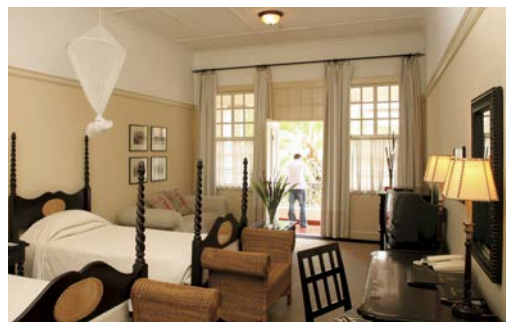
The Victoria Falls Hotel | OOOOC