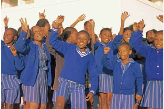
Soweto youth group