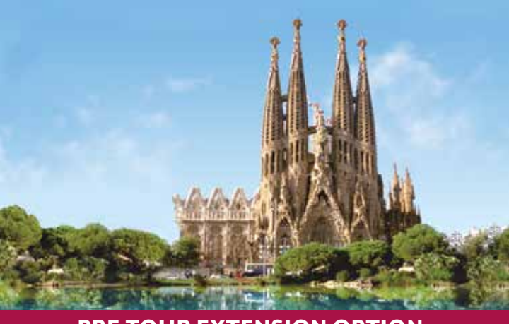
PRE-TOUR EXTENSION OPTION

Barcelona April 12 to 15, 2025 (Program Begins: April 13)