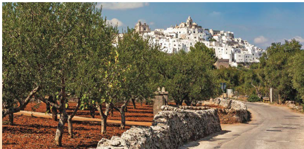
Ostuni, "The White City"

AHI Connects | Olive Mill Outing. Visit a family-run olive mill in the sun-baked countryside. Learn about the history and cultivation process of olives. Unwind over lunch and gather with the mill's employees or owners to discuss life in Italy.