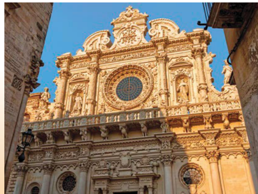
Basilica di Santa Croce, Lecce

Enrichment: History & Architecture of Lecce & Ostuni. Learn about this region's fascinating history and unique architectural styles.