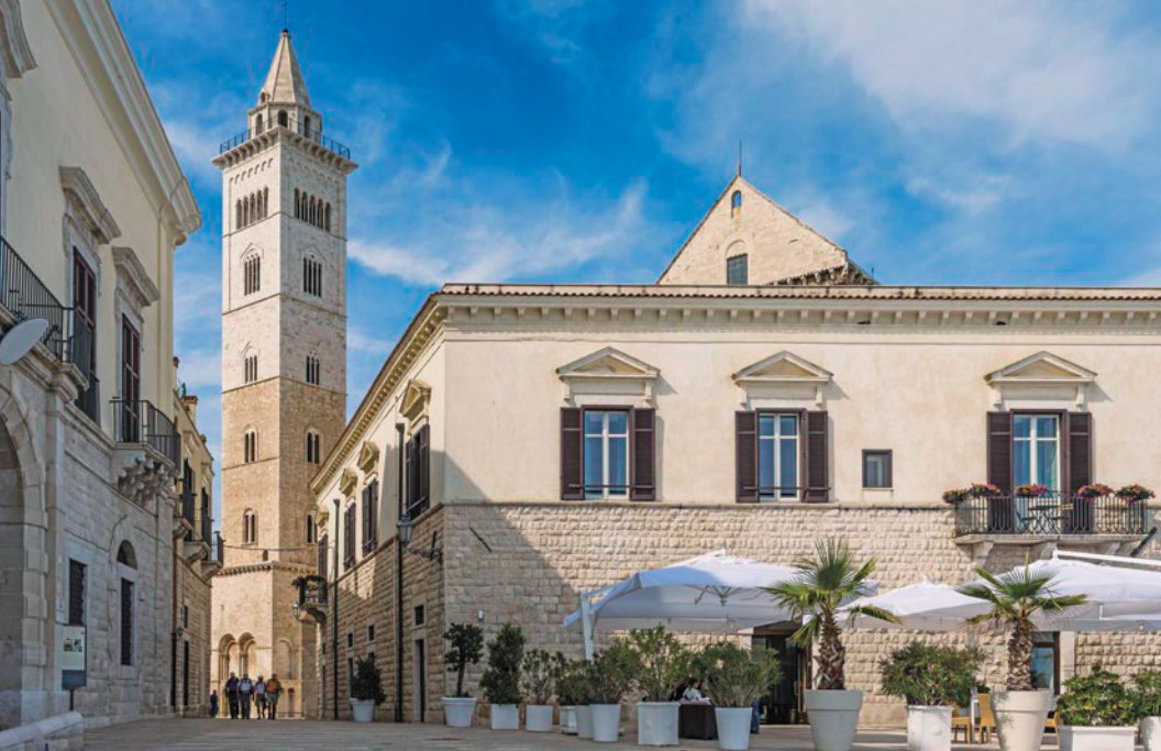
Cathedral bell tower, Trani