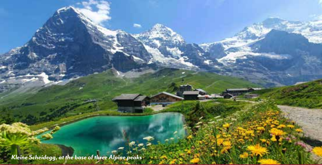
Kleine Scheidegg, at the base of three Alpine peaks

fishermen once lived during the Middle Ages. Visit Notre Dame Cathedral, an exquisitely ornamented Gothic beauty. Join the Captain's Welcome Reception and Dinner. (B,L,R,D)