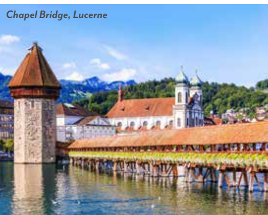
Chapel Bridge, Lucerne

Discover the medieval grandeur of Grand-Île, the historic center of Strasbourg and a UNESCO World Heritage site, during a walking tour. See the bridges and towers of the 13th-century Ponts Couverts, and meander past the many half-timbered houses in the canal-lined Petite France district, where tanners, millers and