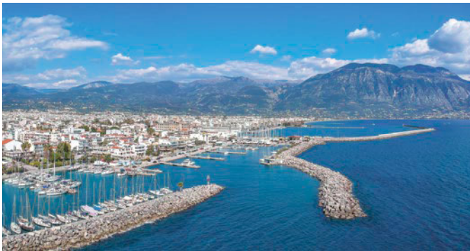
Messinian Bay near Kalamata