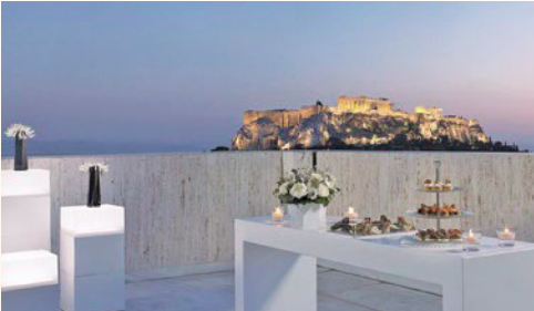
NJV Athens Plaza Hotel | Athens