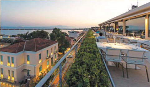
Pharae Palace Hotel | Kalamata