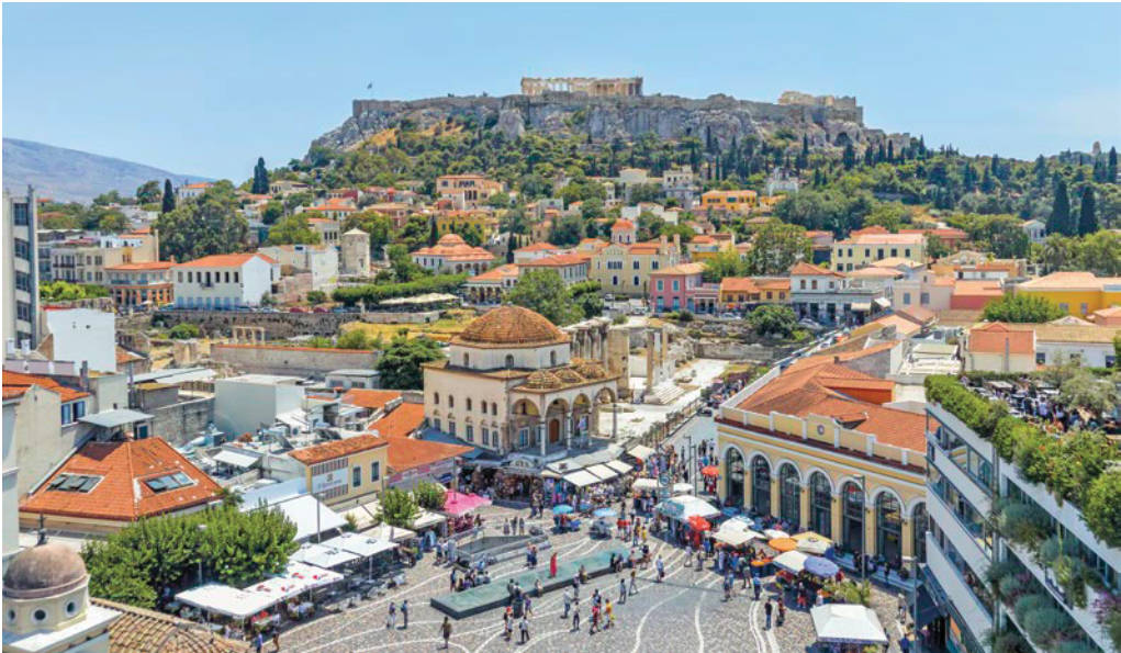
The Acropolis overlooking Athens

Depart your gateway city for Athens, Greece. 🌐