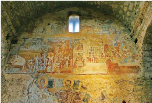
Ancient fresco paintings, Mystras

Enrichment: Classical Greece. Kalamata’s History & Cuisine. Stroll with your guide in Kalamata’s charming old town and learn about the city’s tumultuous past. As you listen to stories of Kalamata’s history and see points of interest, stop to taste traditional foods like their world-famous, fruity, sharp olives and fresh seafood. Try more specialties at lunch in the old town. Messene. This afternoon, take a guided tour of an under-the-radar gem, the splendid, vast ruins of Messene set in a serene mountain valley. Unlike other sites, this ancient city