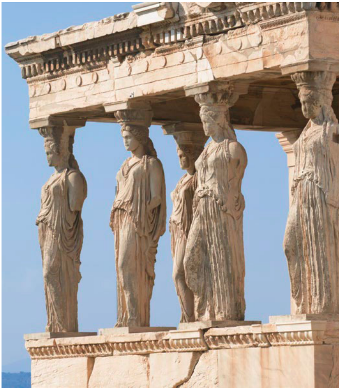
The Caryatid porch of Erechtheion, Acropolis, Athens