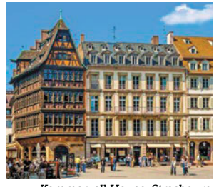
Kammerzell House, Strasbourg