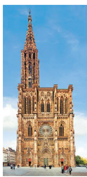
Notre-Dame Cathedral, Strasbourg