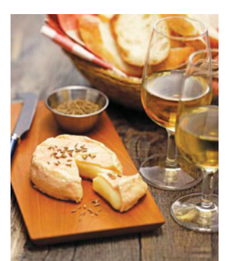
Wine and cheese, Alsace