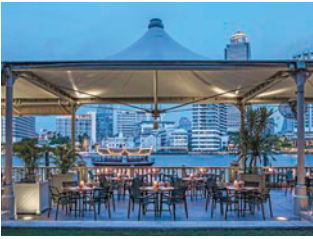
The Peninsula Bangkok | Bangkok, Thailand