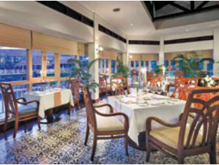
Sofitel Angkor Phokeethra Golf & Spa Resort | Siem Reap, Cambodia