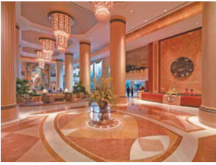
Shangri-La Singapore | Singapore