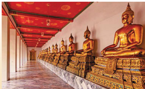
Emerald Buddha Temple, Bangkok