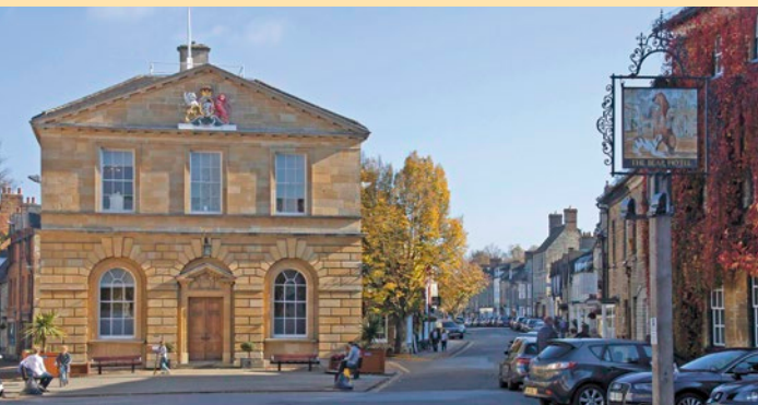
Left: Macdonald Bear Hotel | Above: Town Hall, Woodstock