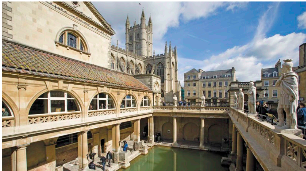
Roman Baths, Bath