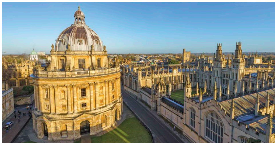
University of Oxford