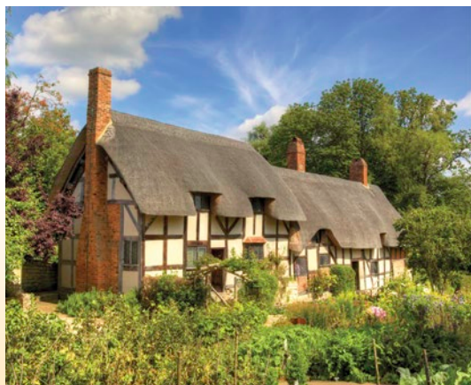
Anne Hathaway's house, Stratford-Upon-Avon

Delight in breathtaking rural England as you discover endearing Cotswolds villages, each with its own unique history and character. Visit Stow-on-the-Wold, designed with narrow lanes