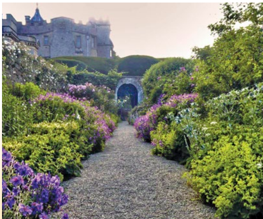
Rousham House and Gardens