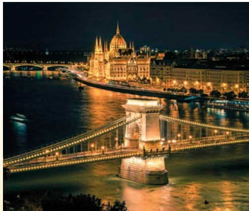
Budapest at night