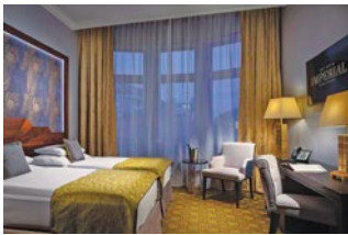
Art Deco Imperial Hotel | Prague, Czech Republic