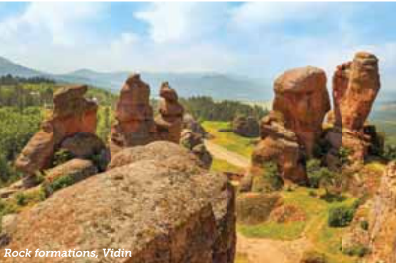
Rock formations, Vidin