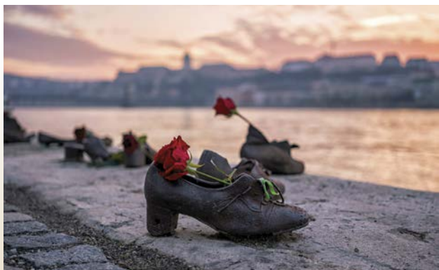
Left: Serbian folk dancers | Above: Shoes on the Danube Bank Memorial