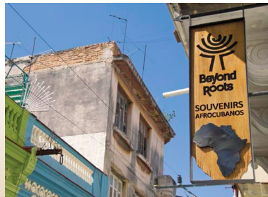
Beyond Roots, Havana

Jewish Center & Cuban Dance. Visit the Sephardic Hebrew Center, where a member