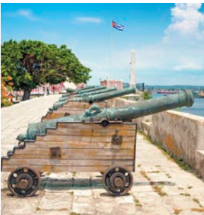
Cannons at fortification, Havana