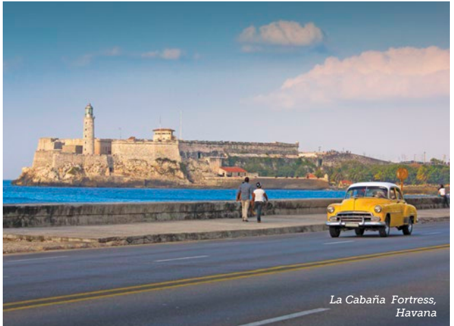
La Cabaña Fortress, Havana