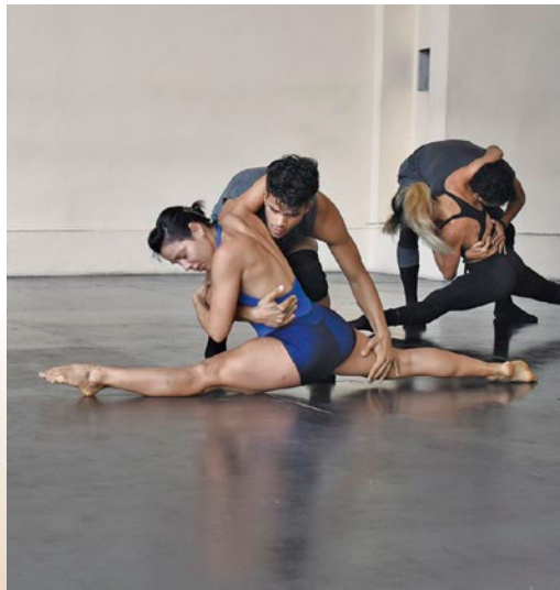
Contemporary Cuban dancers