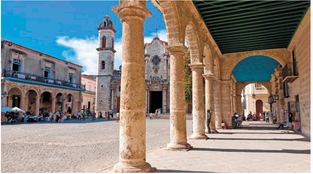
Plaza of the Cathedral, Old Havana