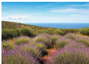
Lavender farm, Hvar