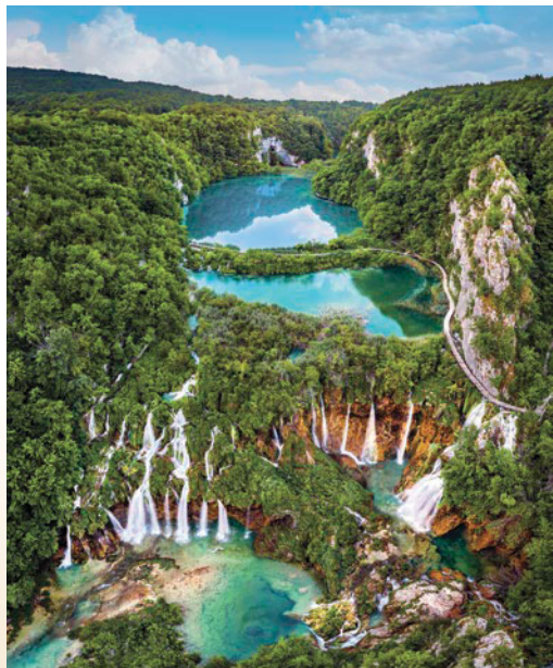
Plitvice Lakes National Park