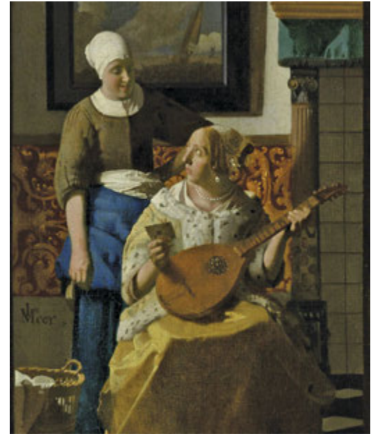
Top: Amsterdam | Above: Detail of "The Love Letter," Special Vermeer Exhibition, Rijksmuseum

De Halve Maan Brewery and delve into Belgian brewing traditions. Savor a glass of their freshly brewed beer and the rooftop city views. (Active)