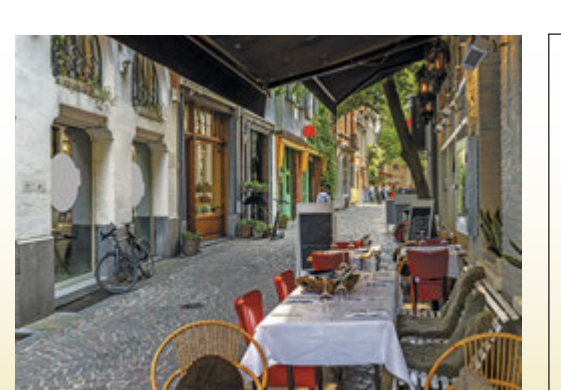
Old Town, Antwerp

Elective experiences available at an additional cost.