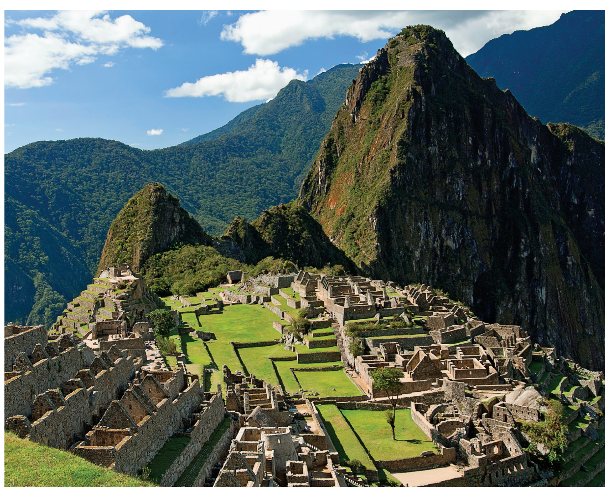
Just 50 miles from Cuzco, Machu Picchu (ca. 1450) was unknown to the outside world until its rediscovery by Hiram Bingham in 1911.

Ratings are based on the Hotel & Travel Index, the travel industry standard reference.