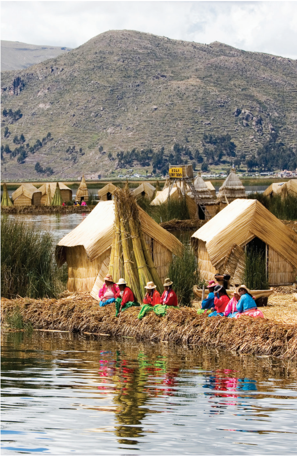
Local women gather on Uros Island