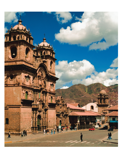
Plaza de Armas, Cuzco

Day 8: Cuzco/Puno This morning we depart for the day-long journey by coach to Puno, on the shores of Lake Titicaca. As we travel through