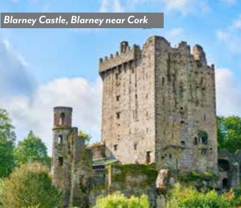
Blarney Castle, Blarney near Cork