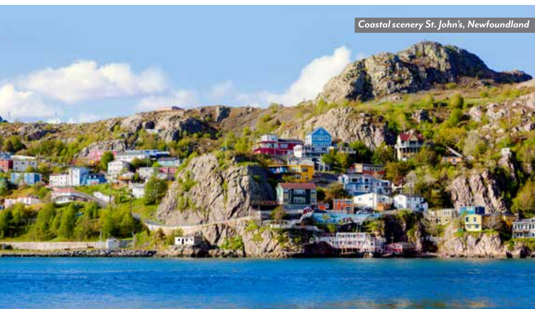
Coastal scenery St. John's, Newfoundland

After breakfast, disembark the ship and continue on the Dublin Post-Program Option or transfer to the airport for your return flight home.