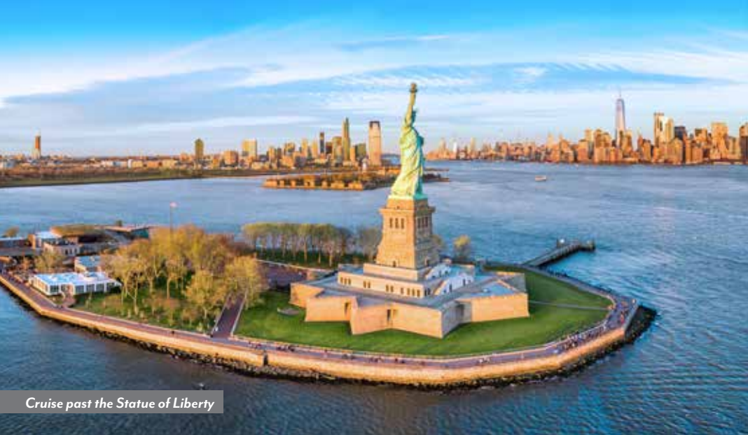
Cruise past the Statue of Liberty