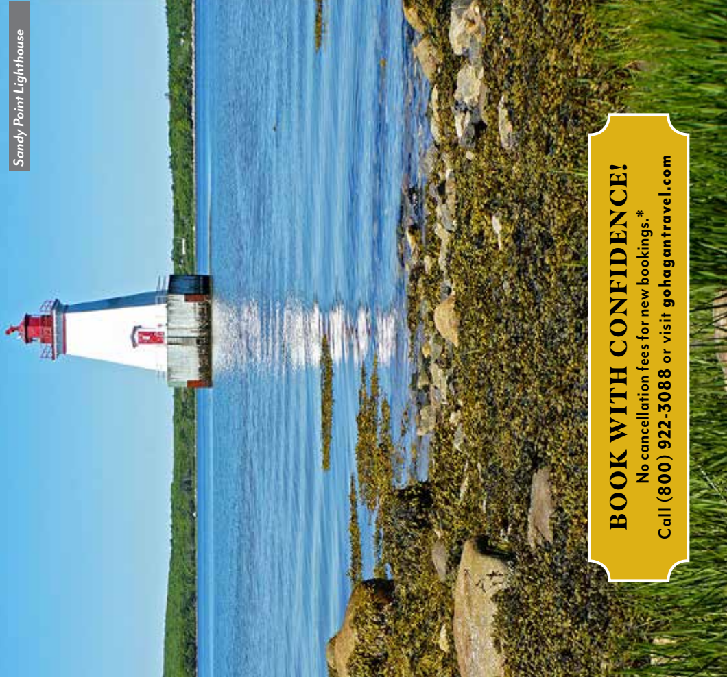
Sandy Point Lighthouse