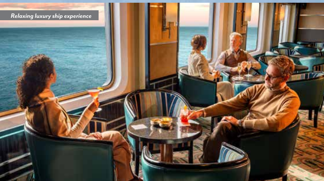
Relaxing luxury ship experience

PHOTO CREDITS: Alamy, Dreamstime, ©JH.Janben [CC BY-SA 3.0], ©Dennis Jarvis [CC BY-SA 2.0], Shutterstock, ©SilverSeas; all images are rights managed and cannot be used without permission.