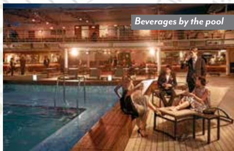
Beverages by the pool

Luxurious transatlantic cruises came into vogue in the Gilded Age of the late 19 th -century, as America's elite boarded grand ocean liners to cross the ocean for what was often a "grand tour" of Europe. The ships of those days offered every luxury imaginable to a first-class clientele eager to see the world. It was a time where the journey itself was just as glamorous as the destination, when champagne flowed, and elegant rounds of badminton were played on deck. Our tour revisits that grand tradition aboard the six-star, all-suite SILVER SHADOW, one of the most luxurious ships in the world. Enjoy the finest food and amenities as you cross the Atlantic for a journey to remember.