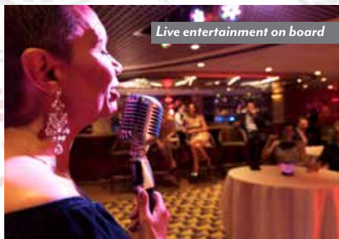
Live entertainment on board