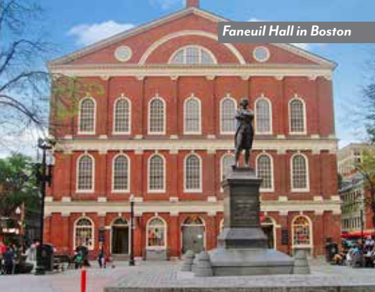
Faneuil Hall in Boston