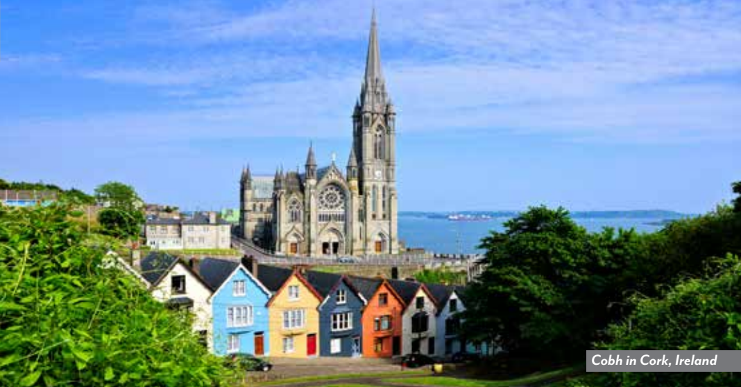
Cobh in Cork, Ireland