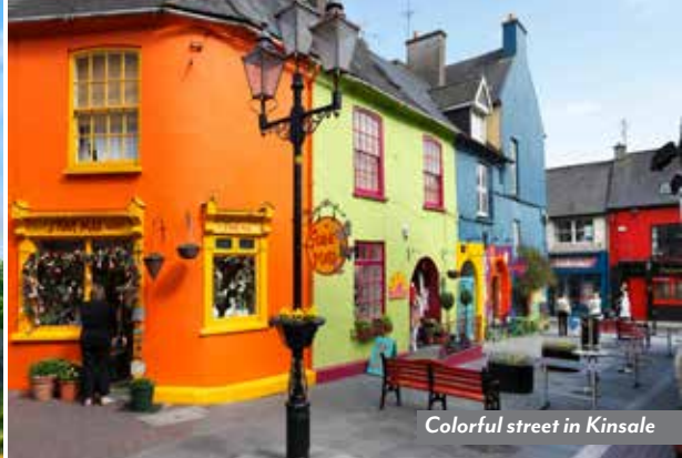
Colorful street in Kinsale