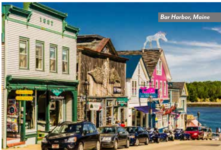
Bar Harbor, Maine

Enjoy time at leisure aboard the ship as you cruise across the North Atlantic Ocean to Europe.