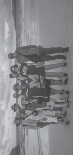
University of Michigan alumni on Orbridge's The Galapagos Islands 2019 travel program.