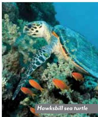
Hawksbill sea turtle

Check into the five-star INTERCONTINENTAL TAHITI and enjoy time at leisure. You may opt to explore