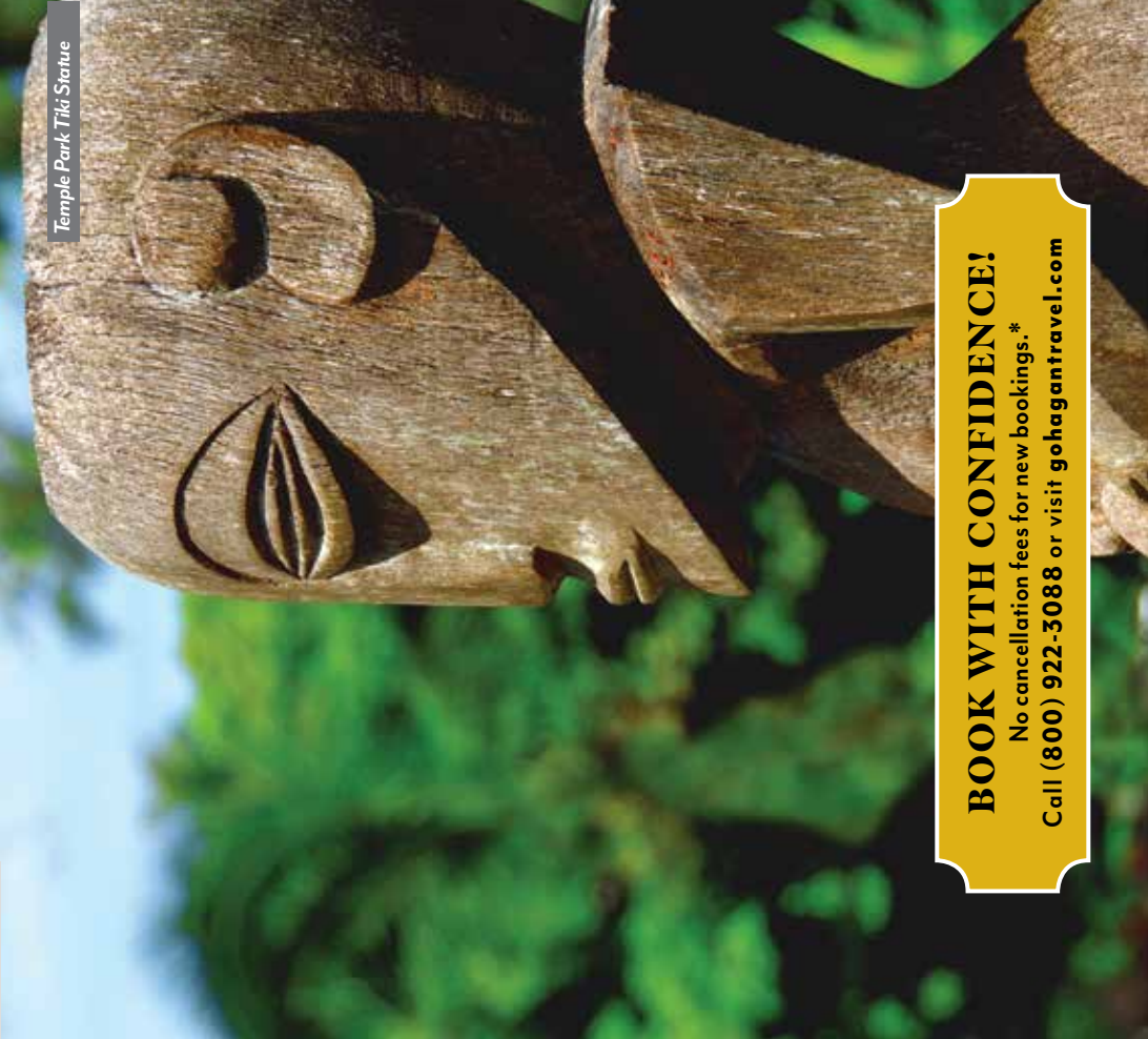
Temple Park Tiki Statue