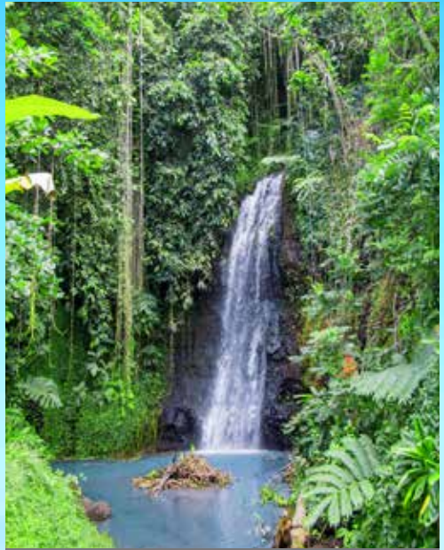
Spring Garden of Vaipahi