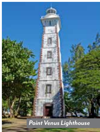
Point Venus Lighthouse

Experience island life on the Bora Bora discovery program with an optional tour on an open-air truck to discover