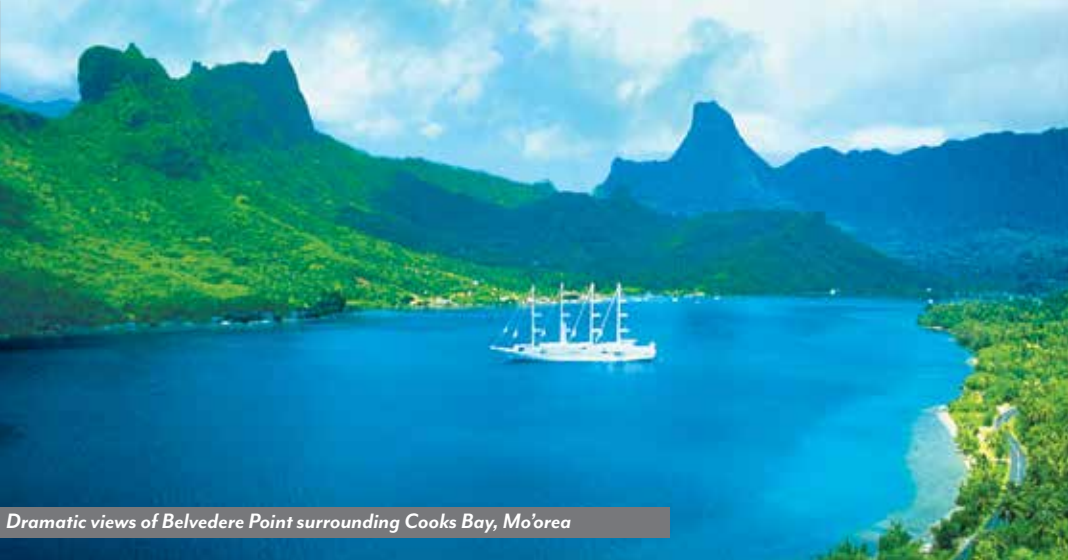
Dramatic views of Belvedere Point surrounding Cooks Bay, Mo'orea