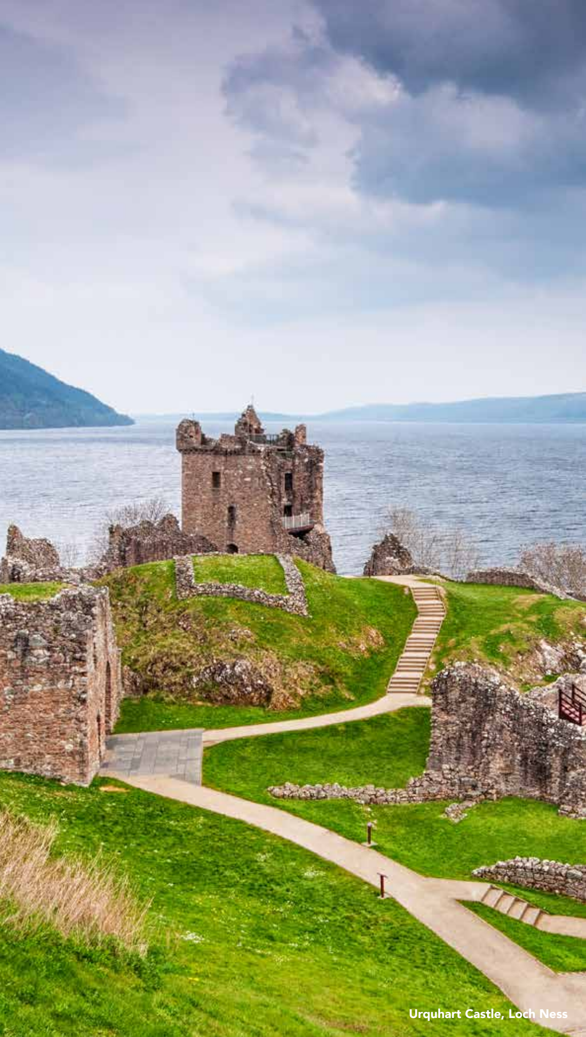
Urquhart Castle, Loch Ness