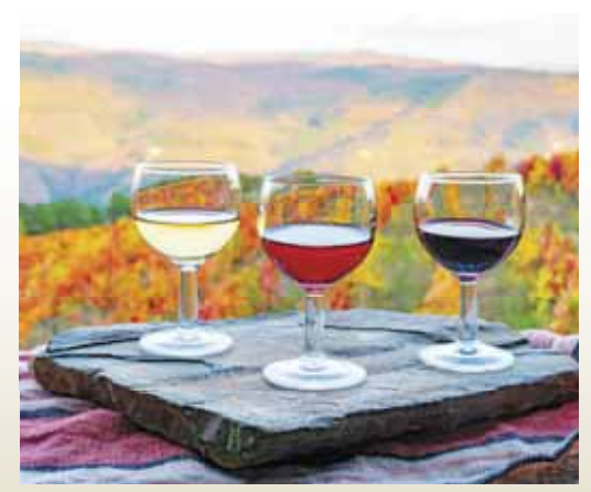
Port wine tasting

Discovery: Lamego . Pretty Lamego is nestled in the heart of the port-producing Douro Valley. Visit Nossa Senhora dos Remédios, a splendid baroque church overlooking the city. Leading to the church is a grand staircase with 686 steps, nine landings, statues, obelisks and azulejos , Portugal's iconic blue-and-white tiles. Spend your final afternoon sailing the Douro Valley as the ship nears Porto.