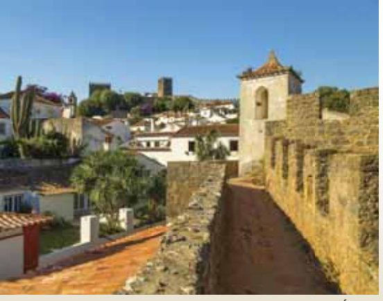
Medieval walls of Óbidos

•Guimarães, Cradle of Portugal. During a walking tour, discover the charms of Guimarães,