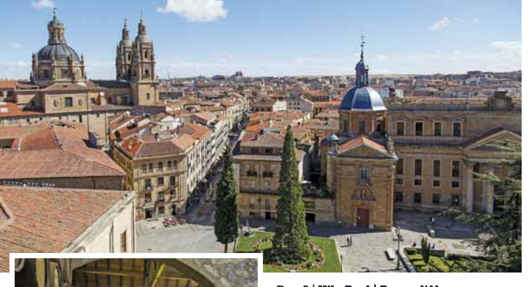
Above: Salamanca | Inset: Port wine cellar

the birthplace of Portugal's first king. Step inside Igreja de Nossa Senhora da Oliveira, and visit the Palace of the Dukes of Bragança, an opulent estate in the city. After, craft your own path of discovery in Guimarães.