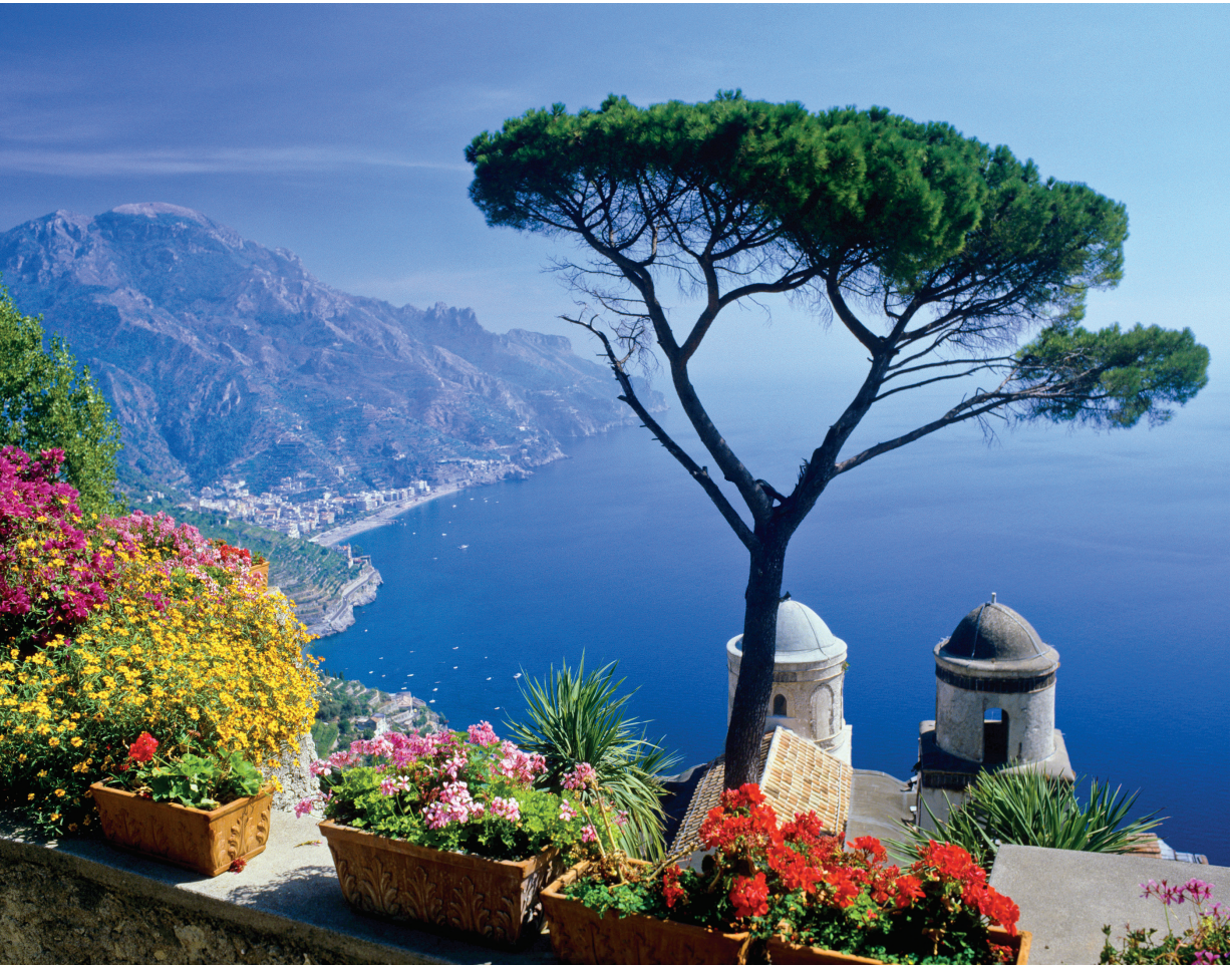
We spend three nights on the stunning Amalfi Coast, with its sheer cliffs, turquoise seas, and classic Mediterranean landscape.