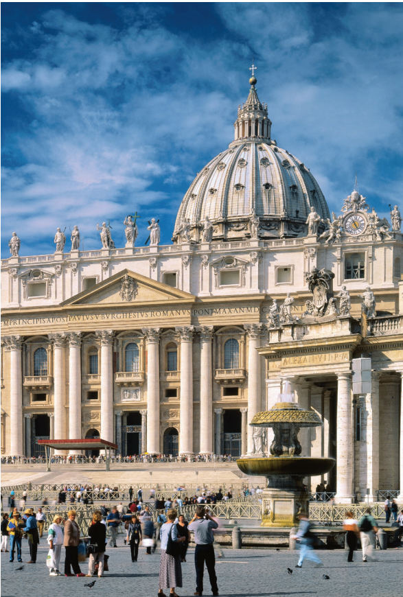
We visit St. Peter's Square and Basilica on Day 7.

Day 16: Depart for U.S. We depart early this morning for our connecting flights to the U.S. B