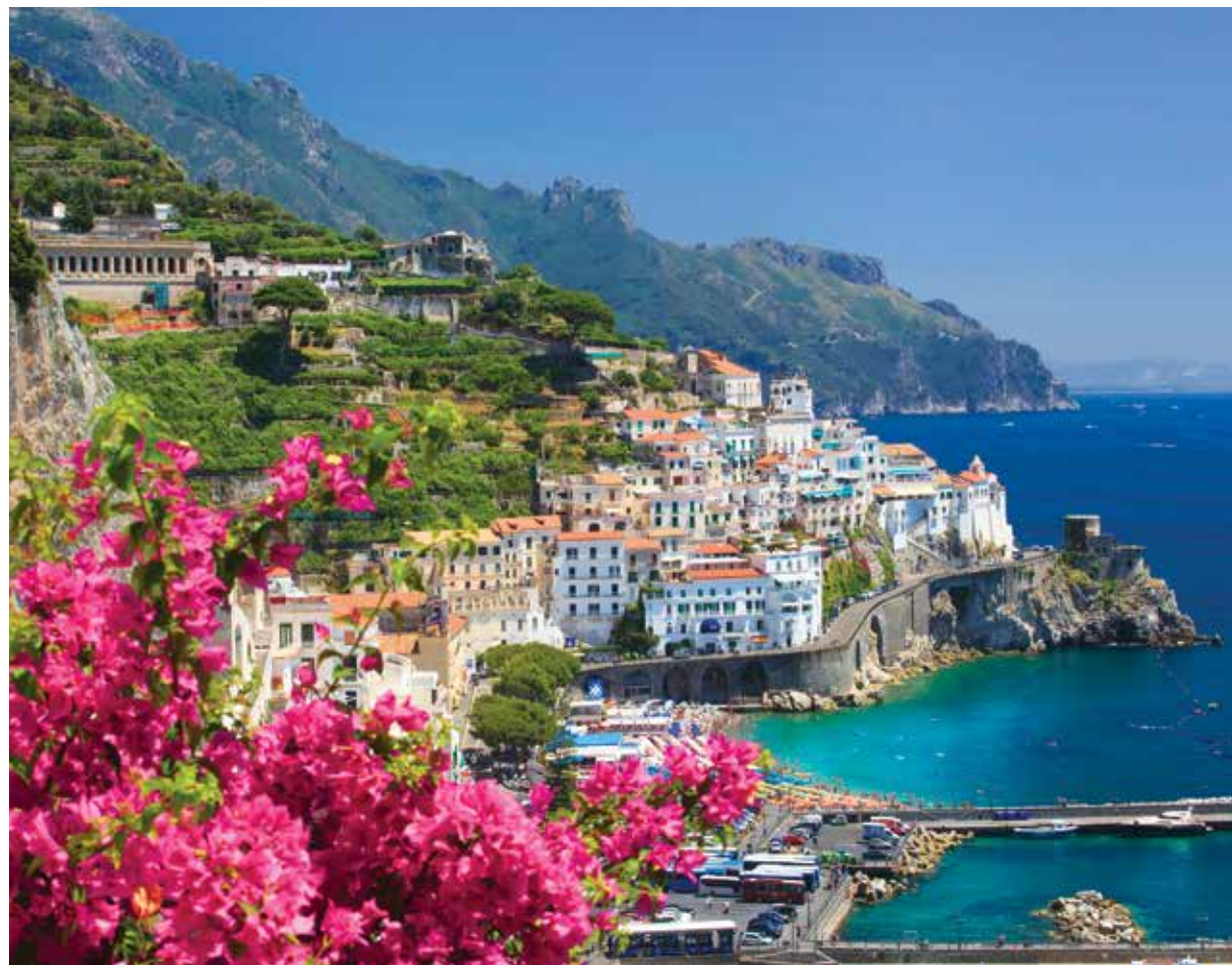
We spend three nights on the stunning Amalfi Coast, with its sheer cliffs, turquoise seas, and classic Mediterranean landscape.

From the breathtaking Amalfi Coast to eternal Rome, through the gentle Umbrian and Tuscan countryside to timeless Venice, this wide-ranging tour showcases ancient sites, contemporary life, priceless art, and beautiful natural scenery. You'll especially appreciate the small size of your group as you stay in unique accommodations in the Tuscan countryside and in a medieval village.