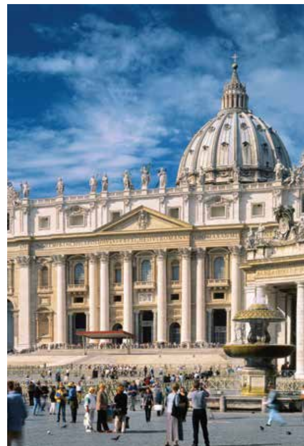
We visit St. Peter's Square and Basilica on Day 7.

Day 16: Depart for U.S. We depart early this morning for our connecting flights to the U.S. B