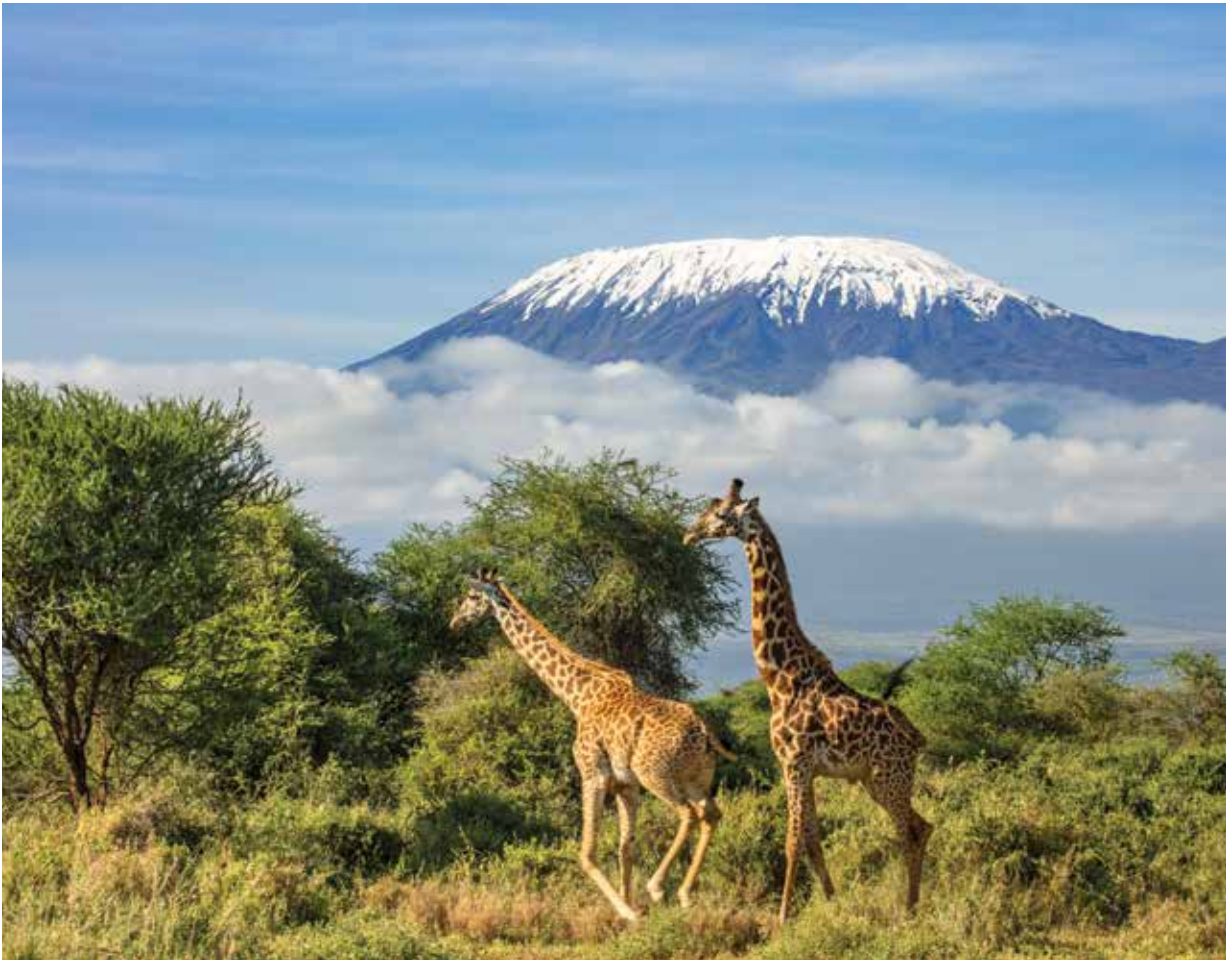
Giraffe roam Amboseli National Park in the shadow of Mt. Kilimanjaro.

Ratings are based on the Hotel & Travel Index, the travel industry standard reference.