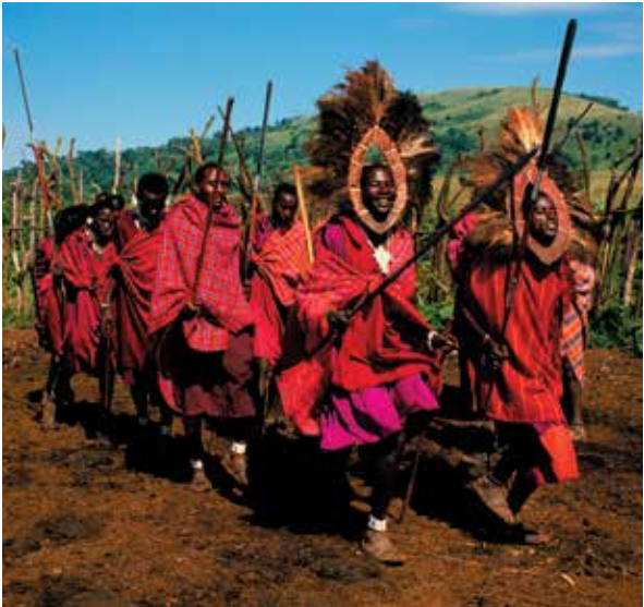
Kenya’s native Maasai people

Day 16: Arrive U.S. We reach the U.S. today and connect with our flights home.