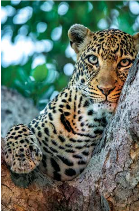
Leopard in the Serengeti