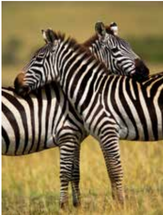
We’re sure to see zebra.

Day 11: Serengeti/Masai Mara We leave Tanzania today, crossing into Kenya and continuing on to Masai Mara by air. Kenya’s premier game reserve rich with animal life, the Mara is the traditional homeland of the Indigenous Maasai people. Known especially for the annual migration that sees some two million wildebeest, plus hundreds of thousands of other plains game migrate here from the Serengeti (Masai Mara being the continuation of the Serengeti in Kenya), the Mara sits in the Great Rift Valley and comprises 583 square miles of vast plains, acacia forests, grass-