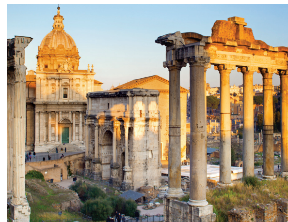
We tour Rome's Forum on Day 6.

Day 14: Tuscany/Venice Leaving Tuscany today, we travel through the Veneto region to Venice, which,