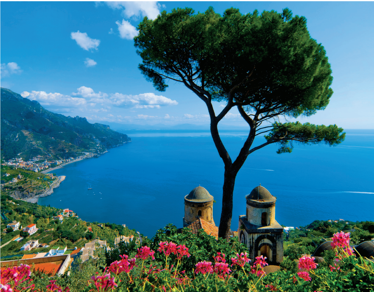
Listed as a UNESCO site, the Amalfi Coast boasts colorful villages and stunning scenery overlooking the Tyrrhenian Sea.