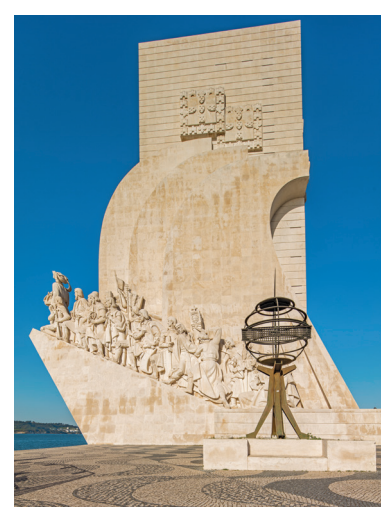
Lisbon's Monument to the Discoveries

Day 9: Carmona/Ronda Leaving Carmona this morning, we travel south to tiny Ronda, one of Spain's oldest and most aristocratic towns. It's set high in the mountains with whitewashed houses clinging improbably to the edge of El Tajo Gorge – 500 feet deep and 300 feet wide. B,D