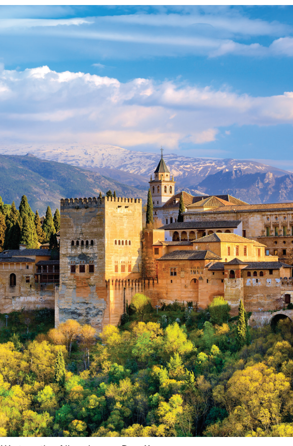
We tour the Alhambra on Day 11.

Day 14: Madrid Today is at leisure to enjoy the Spanish capital as we wish. Tonight we bid " adios " to Spain and our fellow travelers at a farewell dinner. B , D