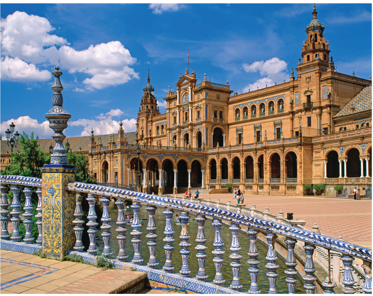
Seville's colorful Plaza de España features tiled fountains, ponds, lush plantings, and grand public spaces.

Ratings are based on the Hotel & Travel Index, the travel industry standard reference.