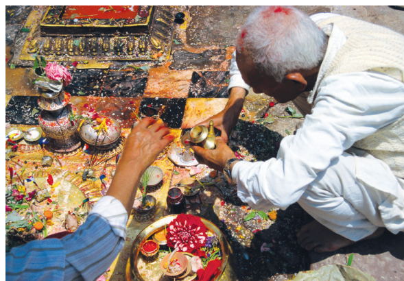
Typical marketplace scene

Day 15: Varanasi Early this morning we return to the Ganges where Hindu pilgrims perform their rituals along the ghats (steps) leading to the river. We visit several ghats by boat as we experience for ourselves the spiritual aura of the hallowed Ganges waters. Then we return to our hotel with time to rest before