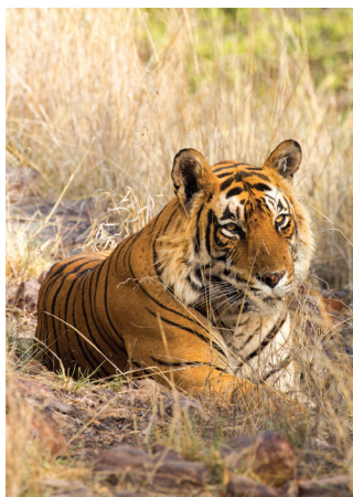
Bengal tiger rests in Ranthambore.

Day 11: Gadoli/Agra En route to Agra, we stop in the ancient village of Abhaneri to see the fortified Chand Baori step well (c. 800 CE), whose 3,500 steps descend some 13 stories into the ground. Continuing on, we reach the ancient Mughal stronghold of Agra, where this afternoon we visit Itimad-ud-Daulah, the two-story marble “Baby Taj” that inspired the Taj Mahal. B,D