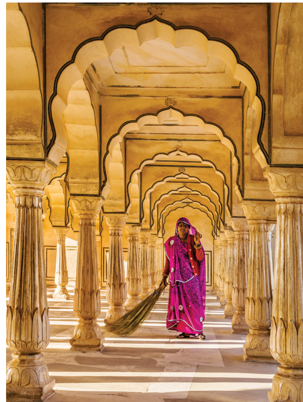
We explore Jaipur’s Amber Fort on Day 6.

this afternoon’s walking tour and private performance of classical sitar. Tonight we celebrate our journey at a farewell dinner at our hotel. B,D