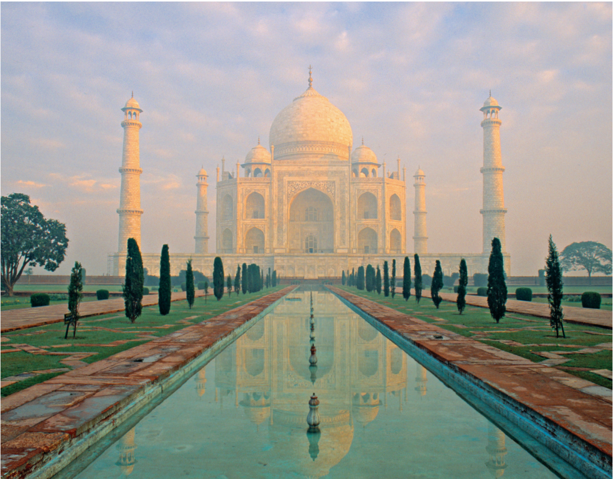
On Day 12 we visit the Taj Mahal, a UNESCO site considered one of the world’s most beautiful buildings.