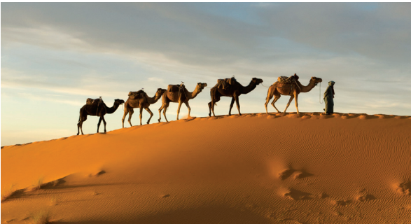
We ride camels in the Sahara on Day 8.

Day 11: Marrakech Once the capital of southern Morocco, the imperial city of Marrakech is an alluring oasis with a temperate climate, distinct charm, and fascinating sights. This morning we travel by horse-drawn carriage from Menara Park to Majorelle Gardens, a private botanical garden with some 15 species of birds native to North Africa and known for its cobalt blue accents. Following a tour of the gardens we visit the nearby Yves St. Laurent Museum. After lunch at our hotel, mid-afternoon we embark on a walking tour of the medina , ending at Djemaa el Fna Square, a UNESCO site and the heart of Marrakech, crowded with snake charmers, entertainers, storytellers, musicians, barbers, and sellers of fruit, water, and spices. B,L