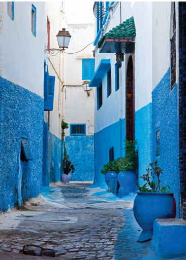
Rabat's Kasbah des Oudaias

Day 9: Erfoud/Tinehir/Todra Gorge/Ouarzazate Our destination today is in the snow-topped High