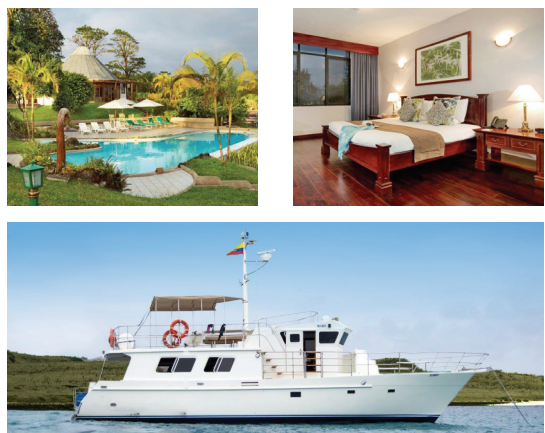
We stay in comfort for four nights in spacious rooms at the Royal Palm Galapagos, set in the lush highlands of Santa Cruz island, and enjoy day cruises aboard the Santa Fe , our privately chartered yacht.

Day 11: North Seymour Island/Bachas Beach This morning we board the Santa Fe , our privately chartered yacht, for North Seymour, a flat, low-lying island with ample opportunities for close encounters with the wild-life on our naturalist-led walk. After lunch, we head back to Santa Cruz island for a nature walk. B,L,D