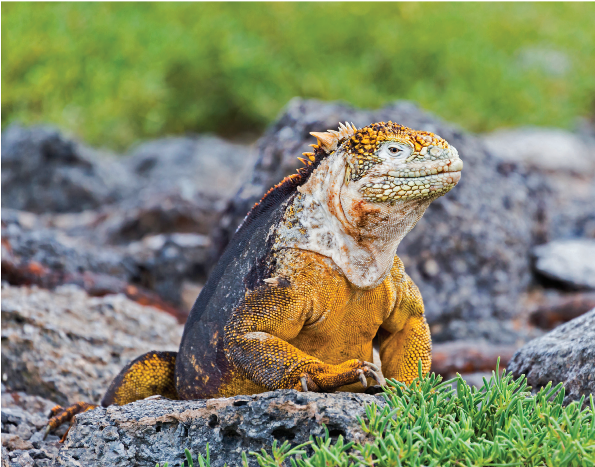
We’ll encounter plenty of wildlife in the Galapagos, including relatives of this land iguana.

Day 1: Depart U.S. for Lima, Peru We depart today for the Peruvian capital. Upon arrival we transfer directly to our hotel.