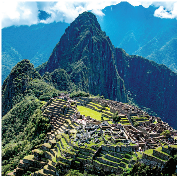
We explore the amazing ruins at Machu Picchu on Days 5 & 6.

of San Francisco. We then enjoy a tour of Quito’s Botanical Gardens featuring an orchidarium with more than 1,200 species of orchids; and a visit to Iñaquito Market, a colorful riot of fresh produce and spices. Then we return to our hotel for some leisure time before tonight’s transfer to the airport for our overnight flight to the U.S. B