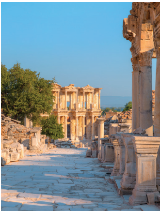
Celsus Library, Ephesus

Day 9: Kusadasi/Ephesus We return to Ephesus to visit the Basilica of St. John, the 6 th -century ruins that stand over what is believed to be the burial site of John the Apostle. Then we learn about Ephesus