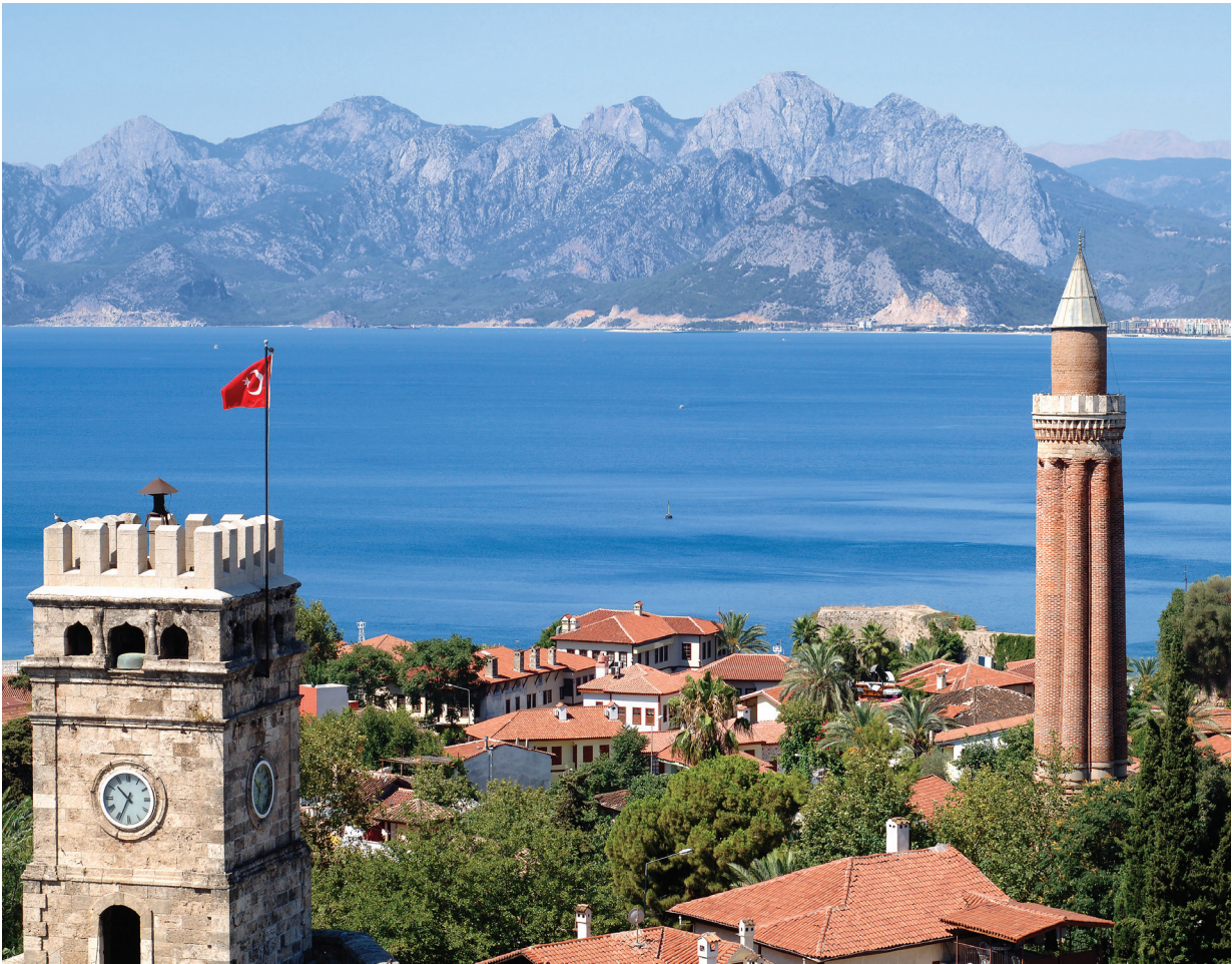
An Antalya landmark, the Yivli Minare (fluted minaret) overlooks the Turquoise Coast.