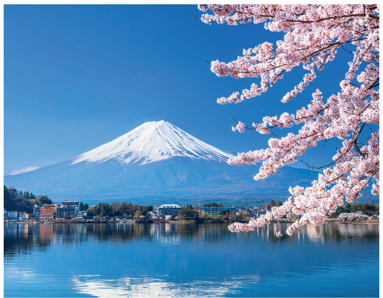
A UNESCO site and "Special Place of Scenic Beauty," beloved Mount Fuji has drawn visitors for centuries.

Ratings are based on the Hotel & Travel Index, the travel industry standard reference. Unrated hotels may be too small, too new, or too remote to be listed.