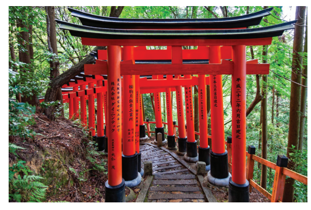
We visit Kyoto's Fushimi Inari shrine on Day 12.

Day 12: Kyoto We continue our encounter with Kyoto today. On tap: the important Fushimi Inari shrine, with its trails straddled by some 1,000 red torii gates and Sanjyusangendo Hall (ca. 1266), an important Buddhist temple housing 1,000 statues of the Thousand-Armed Kannon deity. Then this afternoon is at leisure; tonight we toast our Japan adventure at a farewell dinner at a local restaurant. B , D