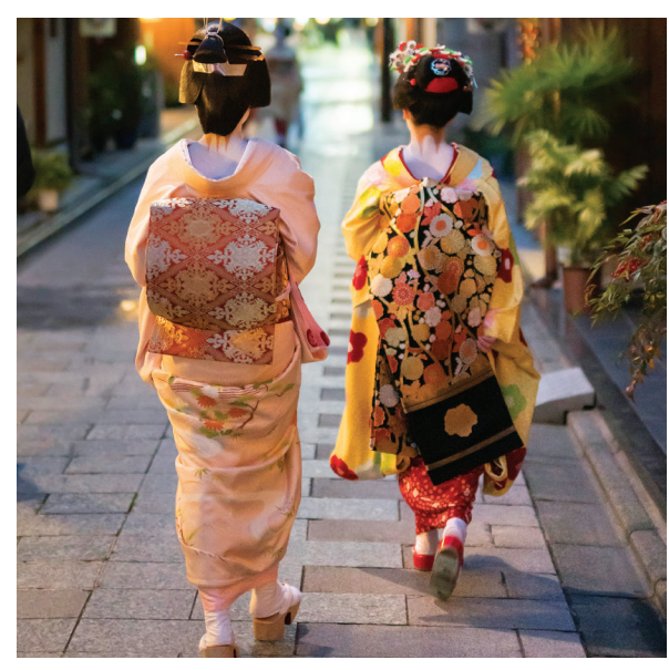
Geishas in traditional dress

Day 8: Takayama/Shirakawa-Go/Kanazawa We leave Takayama this morning for the UNESCO World Heritage site of Shirakawago Gassho-zukuri Village. Comprising buildings relocated from authentic villages nearby that were razed for a dam, the village is also a vibrant community whose residents work together