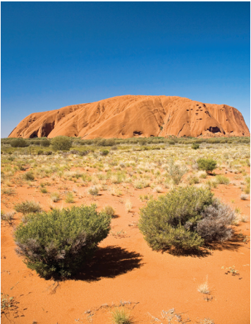
Aboriginal site of Uluru (Ayers Rock)

Day 14: Mount Cook This morning’s tour of alpine Mount Cook Village includes a visit to the Sir Edmund Hillary Alpine Center, where we see a 3D planetarium movie about the region. We also visit the Hillary Gallery, commemorating Sir Edmund’s achievements, including the first ascent of Mount Cook’s difficult South Ridge in 1948 (at 12,316 feet, Mount Cook is New Zealand’s tallest mountain). After time in the village for lunch on our own, this afternoon is at leisure to relax amid the breathtaking scenery, hike, or take an optional scenic flight (weather permitting). B,D