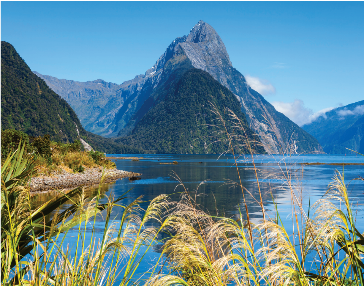
On Day 16, we cruise on Milford Sound surrounded by towering peaks, waterfalls, and rainforests.