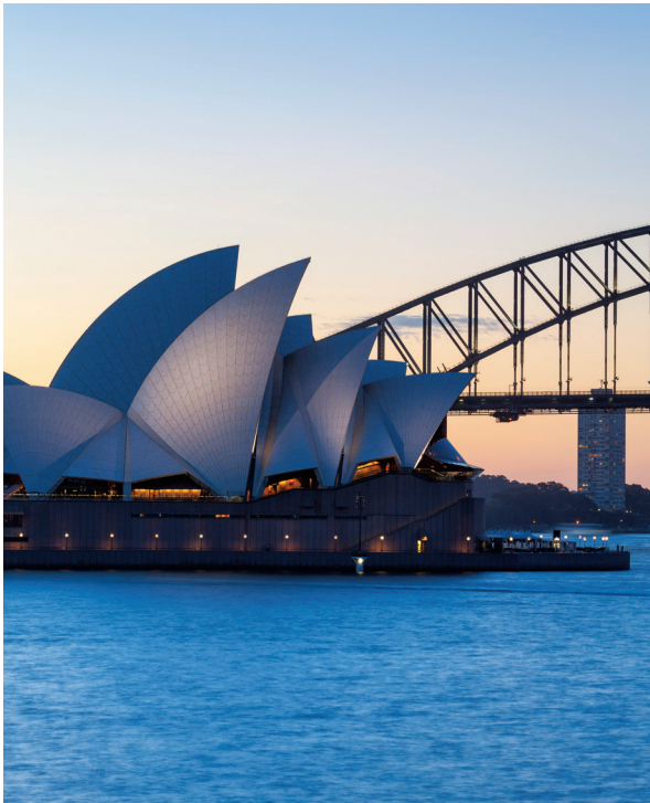
Sydney’s signature Opera House and Harbour Bridge

and Pacific Islander collections. Tonight we enjoy a farewell dinner at our hotel. B,D