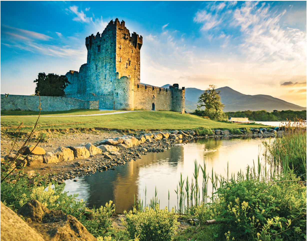
We ride by traditional jaunting carts to Ross Castle on Day 8.