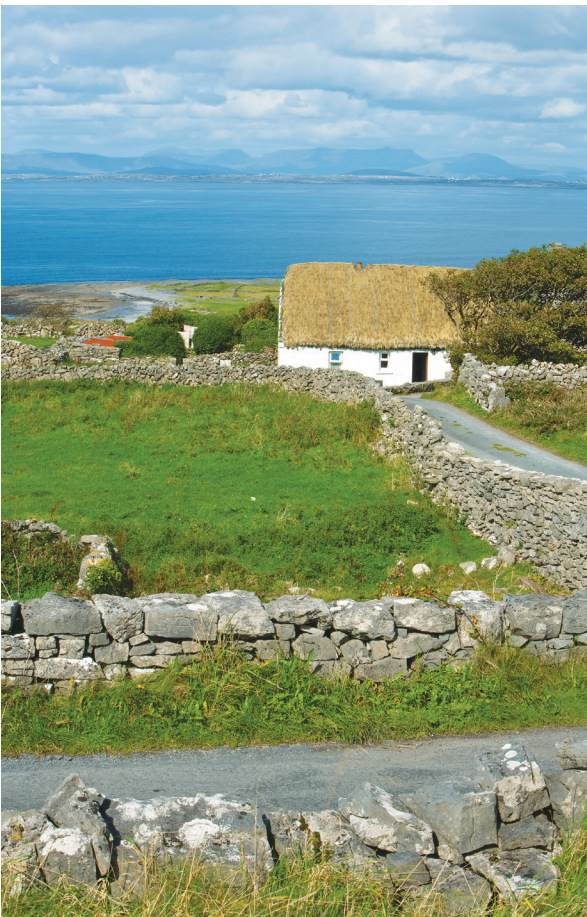
We spend Day 6 on the Aran Islands' Inishmore.

Day 12: Kilkenny/Dublin (Barberstown) We leave Kilkenny this morning for a final visit to Dublin, where we tour fascinating EPIC The Irish Emigration Museum, depicting 1,500 years of Irish history in an interactive environment. Mid-afternoon we reach our hotel outside Dublin; tonight we celebrate our adventure over a farewell dinner. B,D