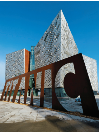
Titanic Museum, optional extension

Day 8: Killarney Our exploration of this attractive town, founded as a resort in the 18 th century, begins with a jaunting cart ride from the center of town to 15 th -century Ross Castle, the last stronghold to fall to Oliver Cromwell’s forces in 1652. Then we travel by boat to Muckcross House, a 19 th -century Elizabethan-style manor which showcases the art and craft of bookbinding, pottery, and weaving. We tour the elegantly furnished rooms, as well as the informal garden. Lunch is on our own here before