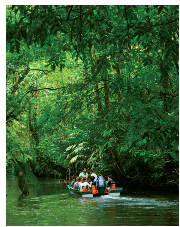
Tortuguero canals (pre-tour option)

Day 7: Monteverde This morning we embark on a guided walk through Monteverde's biological reserve, learning about the amazing biodiversity in this relatively small area. After lunch together, we visit the Monteverde Bat Jungle to learn about Costa Rica's diverse – and important – bat population. Late this afternoon we return to our hotel for time at leisure before visiting with a local resident who will share stories of how Quakers have influenced the region, including their founding of Monteverde's biological reserve. We dine together this evening. B , L , D