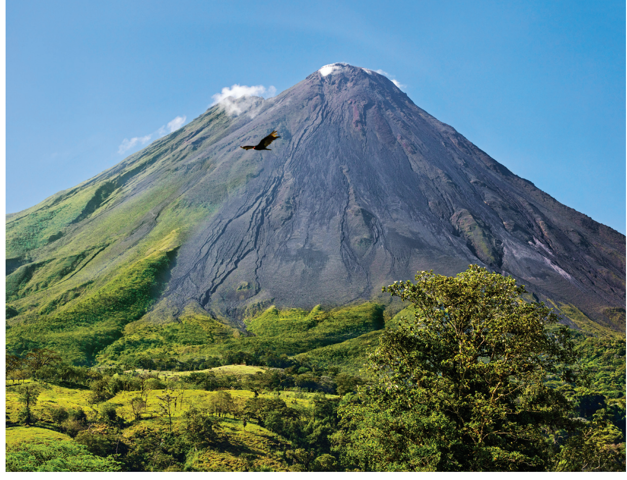
We see Arenal, one of the world's most active volcanoes, from a safe distance.

Day 1: Depart for San Jose, Costa Rica We arrive in the Costa Rican capital and transfer to our hotel located in the Escazu area outside the city. This afternoon and evening are at leisure.