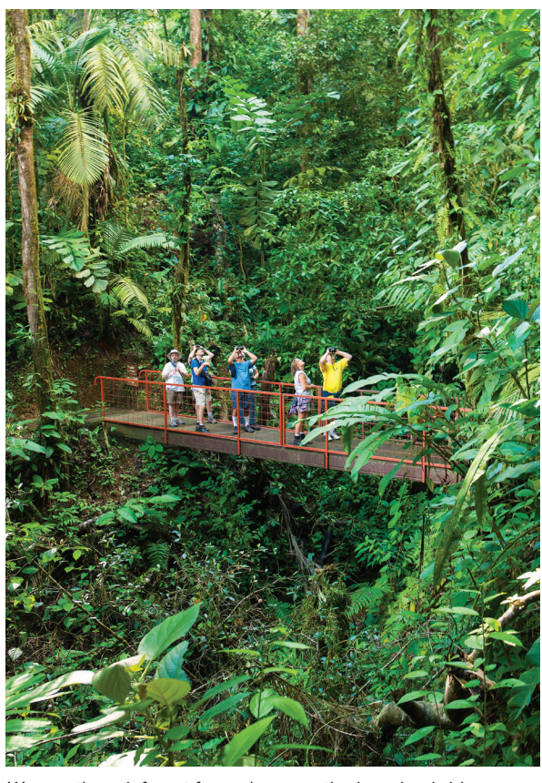
We see the rainforest from above on the hanging bridges.

at leisure along one of Costa Rica's most beautiful Pacific Coast settings. B,L