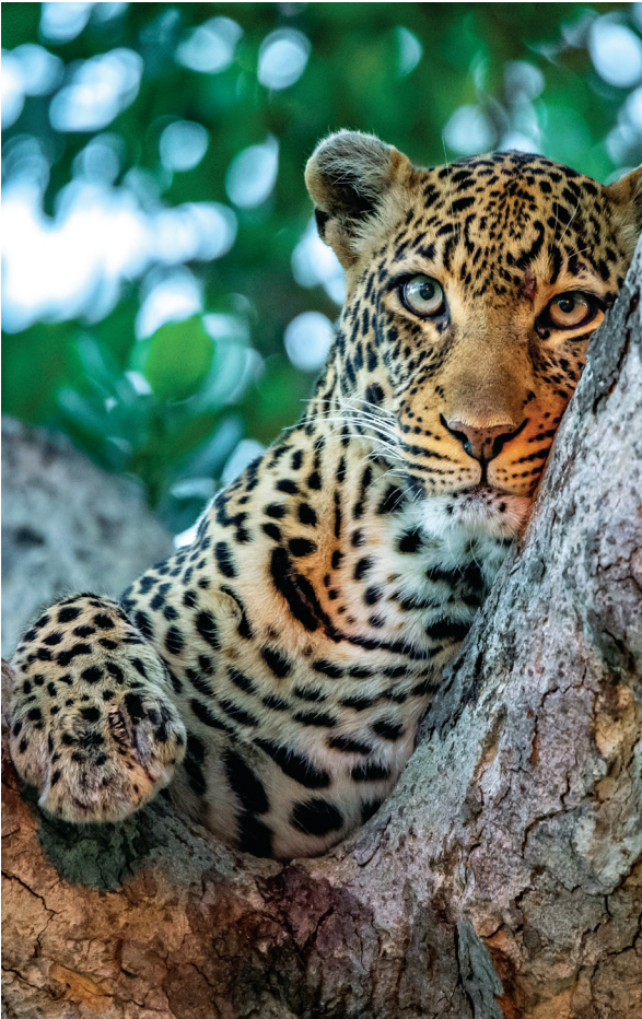
Leopard in the Serengeti