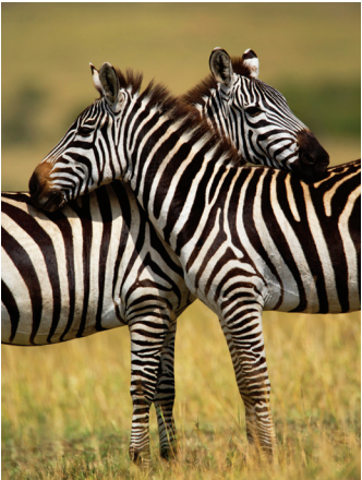
We’re sure to see zebra.

Day 11: Serengeti/Masai Mara We leave Tanzania today, crossing into Kenya and continuing on to Masai Mara by air. Kenya’s premier game reserve rich with animal life, the Mara is the traditional homeland of the Indigenous Maasai people. Known especially for the annual migration that sees some two million wildebeest, plus hundreds of thousands of other plains game migrate here from the Serengeti (Masai Mara being the continuation of the Serengeti in Kenya), the Mara sits in the Great Rift Valley and comprises 583 square miles of vast plains, acacia forests, grass-