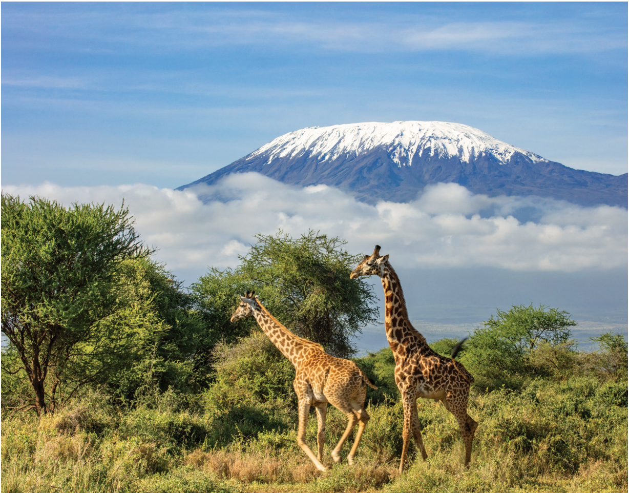
Giraffe roam Amboseli National Park in the shadow of Mt. Kilimanjaro.