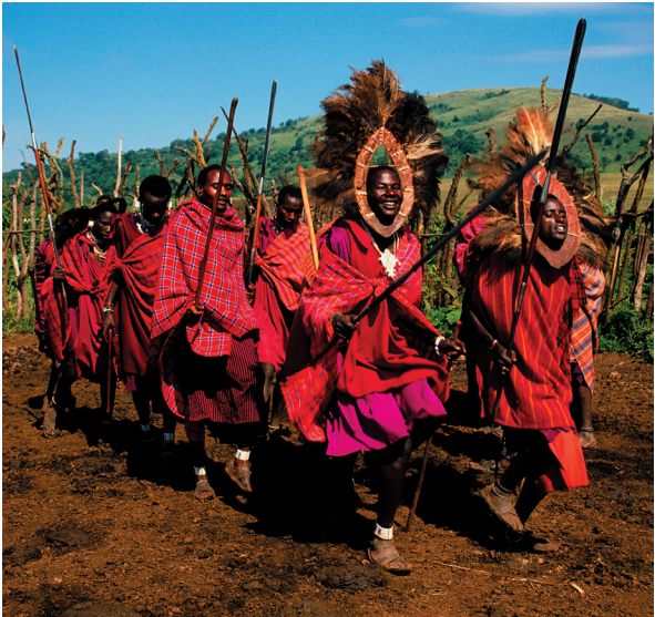
Kenya’s native Maasai people

Day 16: Arrive U.S. We reach the U.S. today and connect with our flights home.