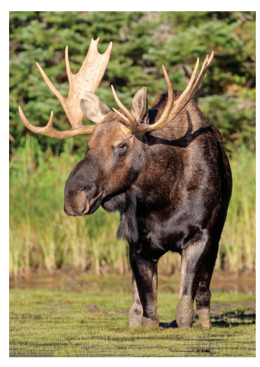
Moose abound in the Rockies.

Equipped to drive right onto the glacier itself, the massive Ice Explorer boasts super-sized tires specially designed for glacier travel. Upon reaching Athabasca, we disembark to explore, take photos, and fill our water bottles with the pure water from the glacier. Then we descend to the base station for lunch before we begin our drive northward again, arriving at our centrally located hotel in the town of Jasper, which is within Jasper National Park (also a UNESCO site). We enjoy dinner together at our hotel. B , L , D