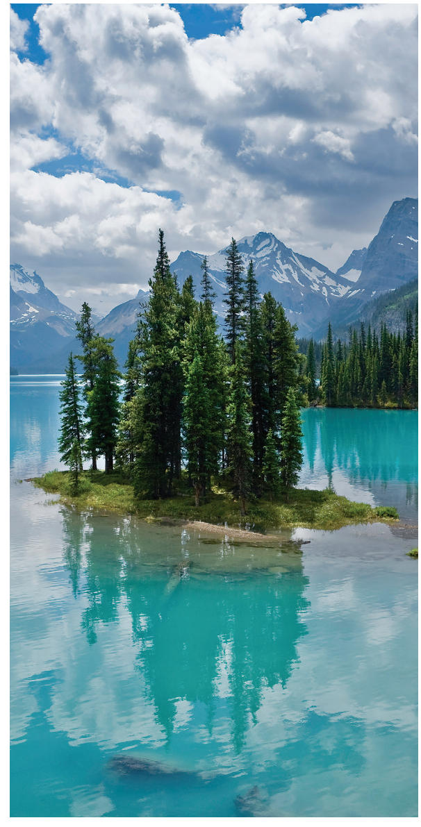
Spirit Island sits in stunning Maligne Lake.