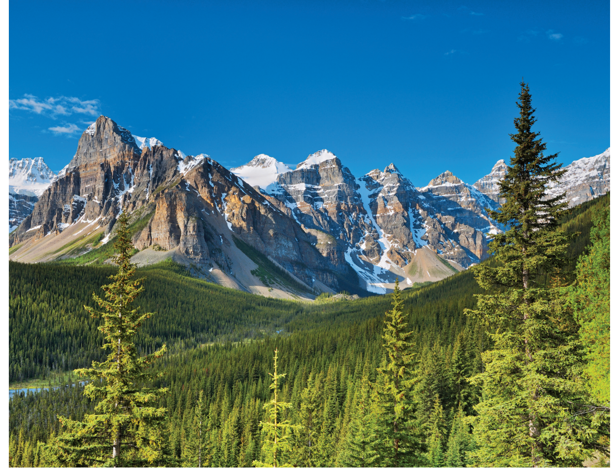
We spend several days absorbing the natural beauty of the Canadian Rockies' jagged peaks, pristine rivers, and primeval forests.

Ratings are based on the Hotel & Travel Index, the travel industry standard reference. Unrated hotels may be too small, too new, or too remote to be listed.