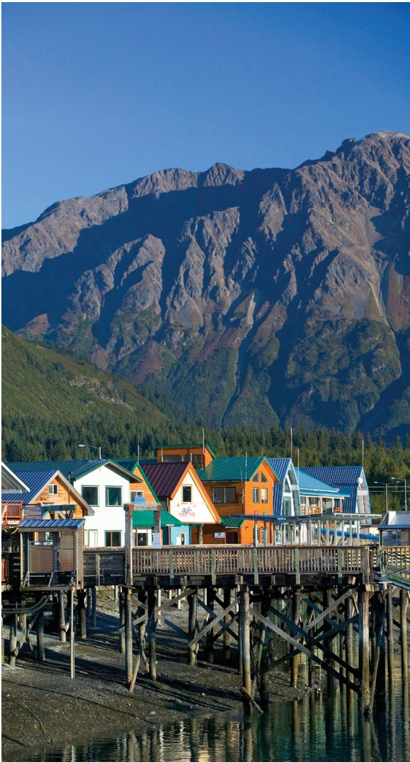
Colorful buildings overlook Seward’s harbor.