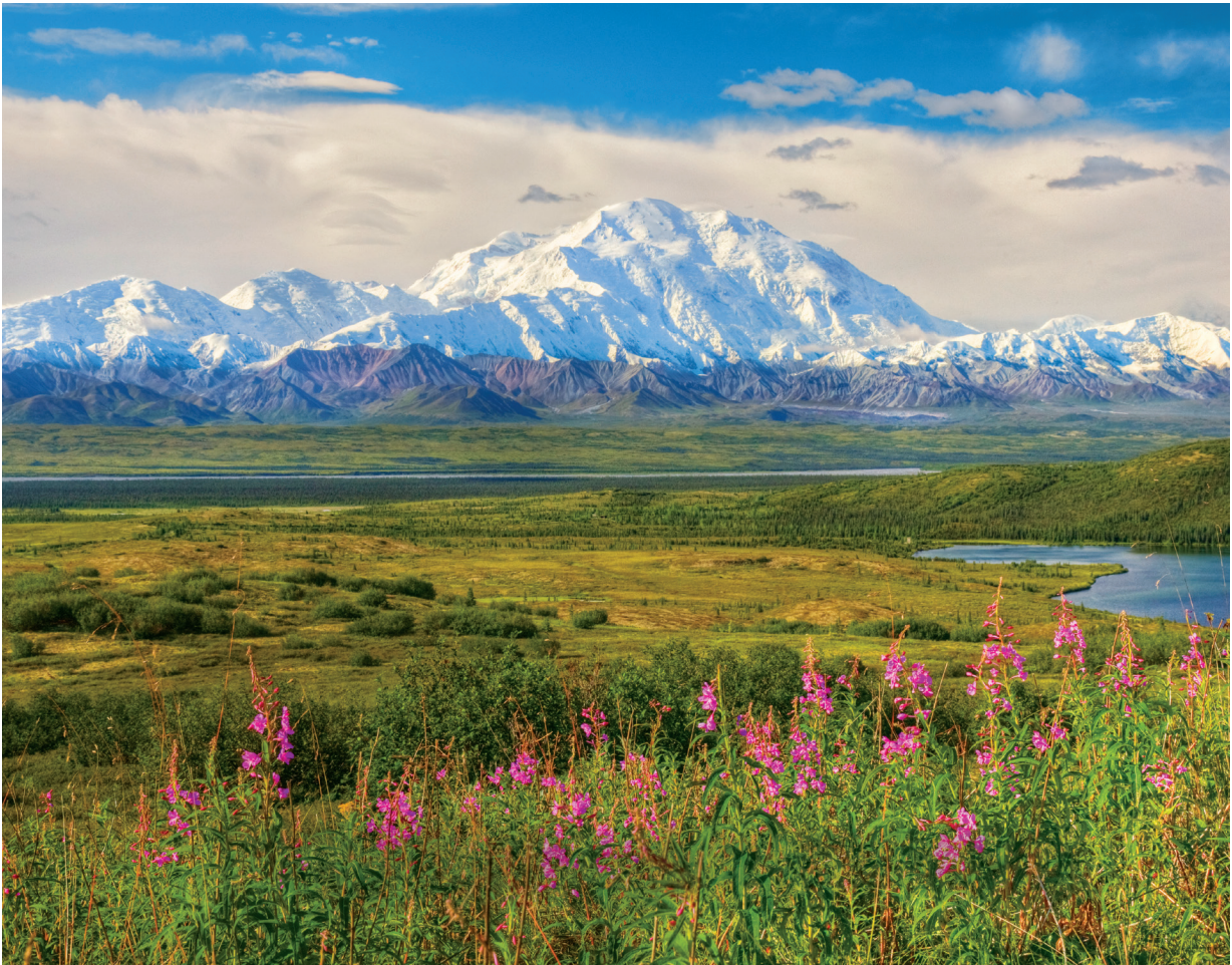
A highlight of our journey to Alaska: Denali, North America’s highest peak

Day 1: Depart for Anchorage, Alaska We depart today for Anchorage, Alaska’s largest city. Upon arrival, we check in to our centrally located hotel. As guests’ arrival times may vary, we have no group activities or meals planned. Dinner tonight is on our own.