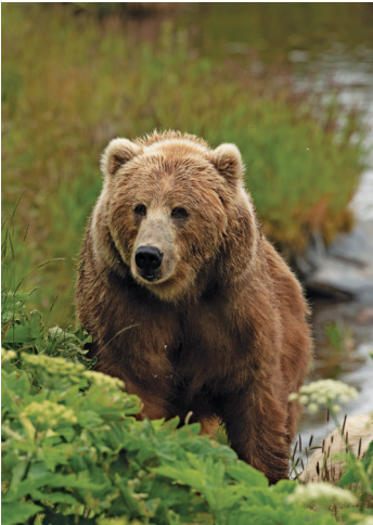
We may see bears in Alaska.

Day 6: Wrangell-St. Elias National Park Home to more than 150 glaciers, Wrangell-St. Elias National Park contains the largest collection of these ice masses in North America. We see one of these glaciers up close today on our singular half-day hike to Root Glacier. After being fitted with crampons – steel shoe spikes created to traverse ice – we begin our three-mile excursion to the glacier and behold the natural beauty before us: unspoiled icefields, blue pools, cascading waterfalls, deep canyons, narrow crevasses. We eat a sack lunch in the wild then return to our lodge for