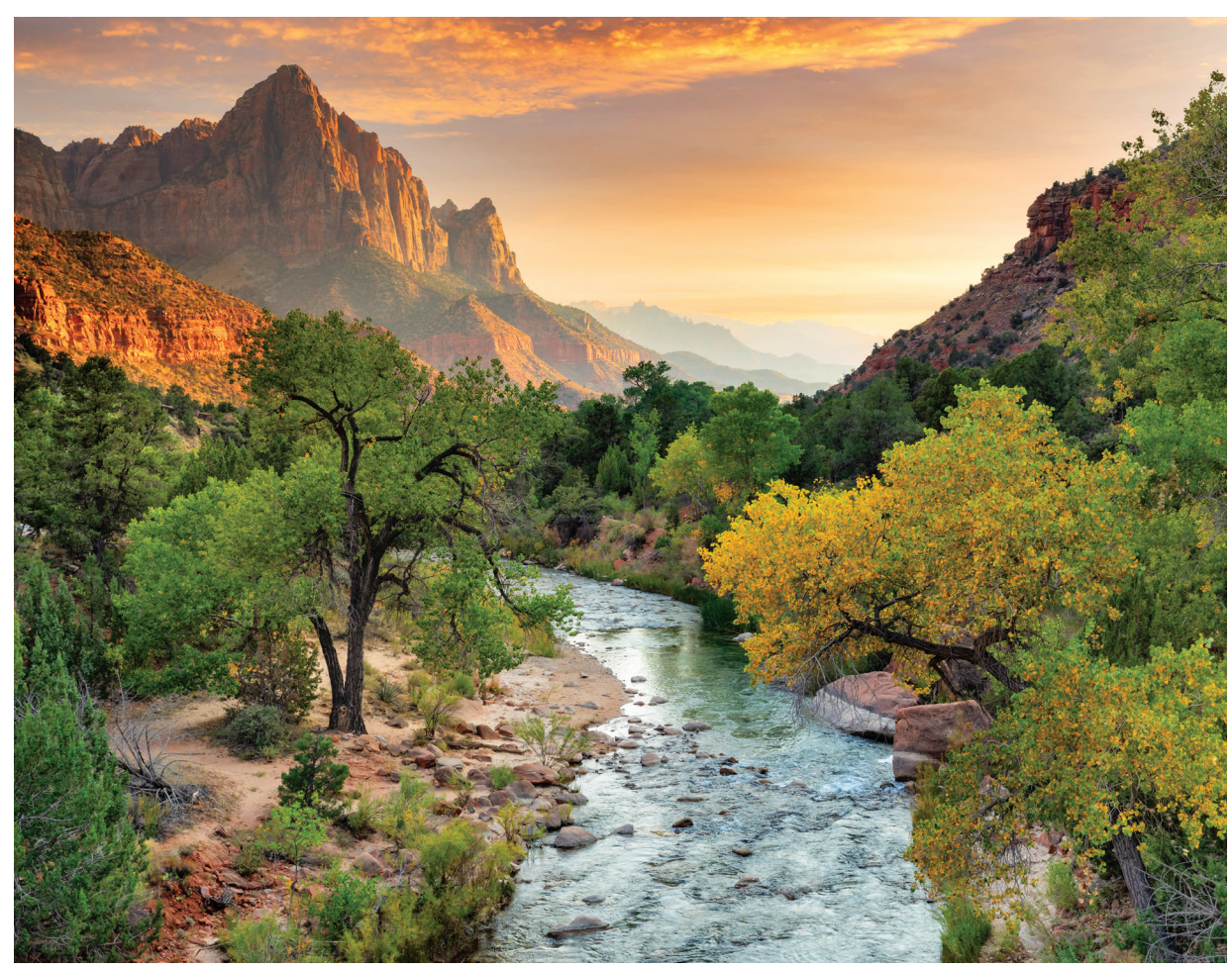
Zion NP's 232 square miles boast a diversity of landscapes, including high plateaus, deep sandstone canyons, and the Virgin River.

Day 1: Depart for Phoenix, Arizona We depart today for Phoenix, Arizona. As guests' arrival times may vary, we have the day at leisure to explore Arizona's capital city as we wish. This afternoon we check in at our hotel, where we enjoy a welcome briefing and dinner together. D