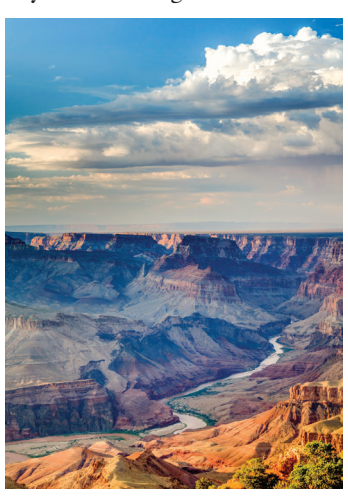
Day 6: Page/Colorado River/Bryce Canyon National Park, Utah Our long, but incredibly scenic, day of travel begins with a rousing motorized rafting

Day 5: Grand Canyon/Page/Antelope Canyon/ Lake Powell Today we travel to Page, Arizona, gateway to the imposing Glen Canyon Dam and its reservoir, Lake Powell. After reaching Page early this afternoon, we have lunch on our own then visit the sinuous – and spectacular – Upper Antelope Canyon. We travel onto Navajo land to reach this slot canyon, known to local tribes as "the place where water runs through rocks" - and one of the most photographed slot canyons in the world. Our tour through this stunning passageway reveals red-orange walls of "flowing" rock rising to heights of nearly 120 feet - the narrow canyon's hard edges smoothed away by eons of water and sand erosion. We check in at our lakeside hotel this afternoon then enjoy dinner together there tonight. B,D