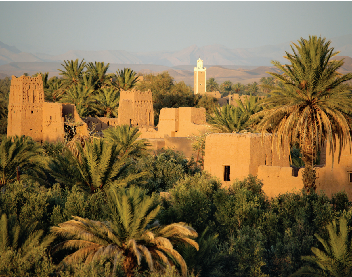
We encounter many of Morocco's age-old kasbahs on our journey.

Ratings are based on the Hotel & Travel Index, the travel industry standard reference.