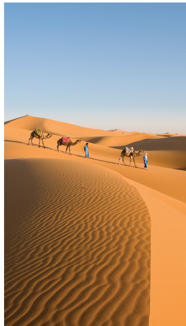
We ride camels in the Sahara on Day 8.