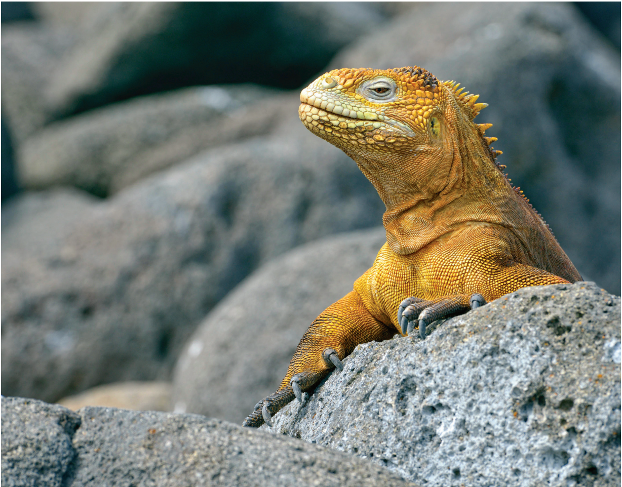
We’re sure to encounter plenty of wildlife in the Galapagos, like this handsome land iguana.

Ratings are based on the Hotel & Travel Index, the travel industry standard reference.