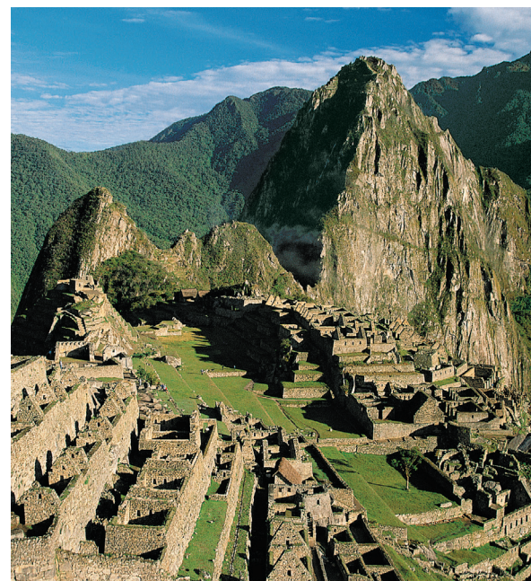
We explore the amazing ruins at Machu Picchu on Days 5 & 6.

Day 16: Arrive U.S. We arrive in the U.S. this morning and connect with our return flights home.