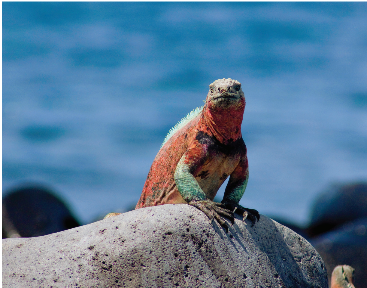
We're sure to encounter plenty of wildlife in the Galapagos, like this handsome marine iguana.